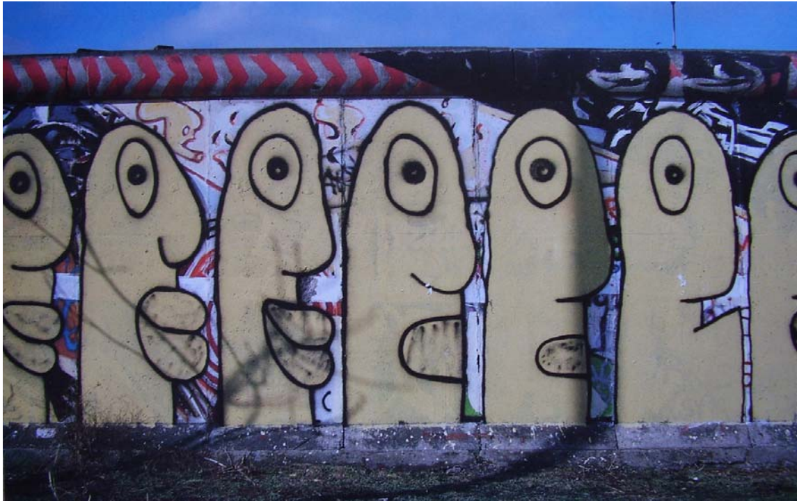
Figure 1 (Waldenburg 44)