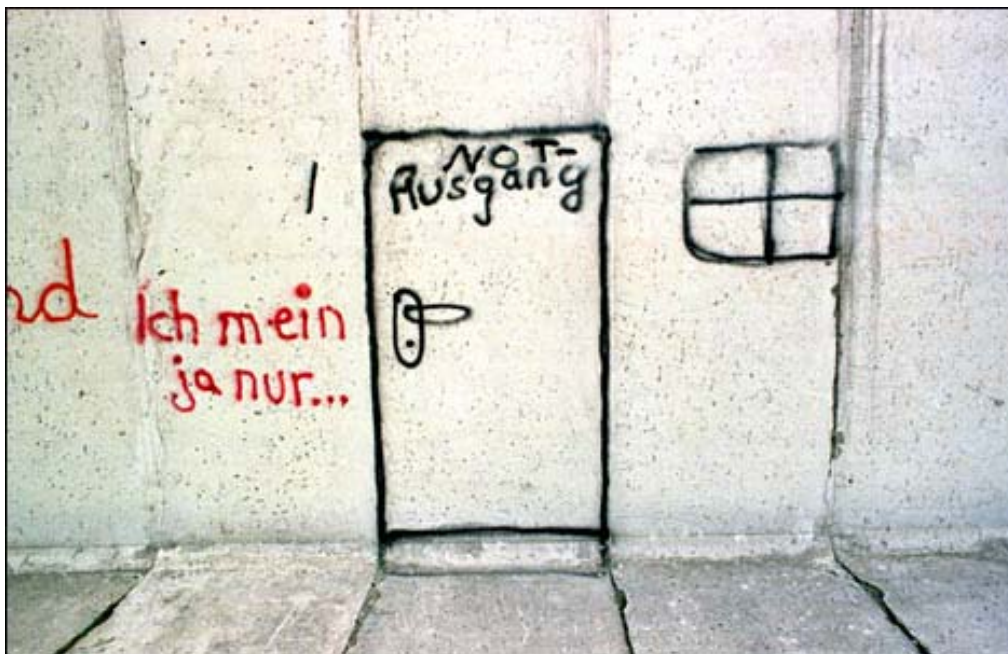
Figure 14 (Rosset Gallery 1)