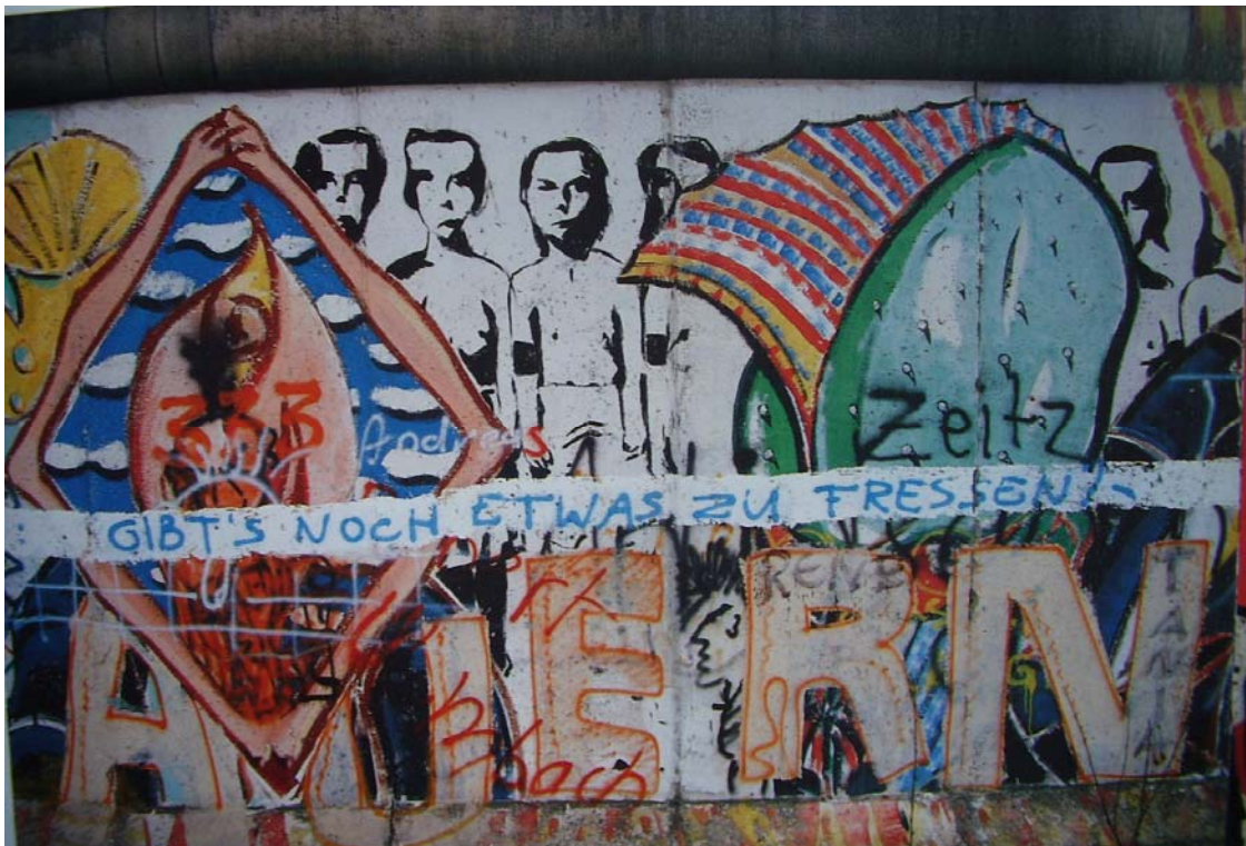
Figure 20 (Waldenburg 59)