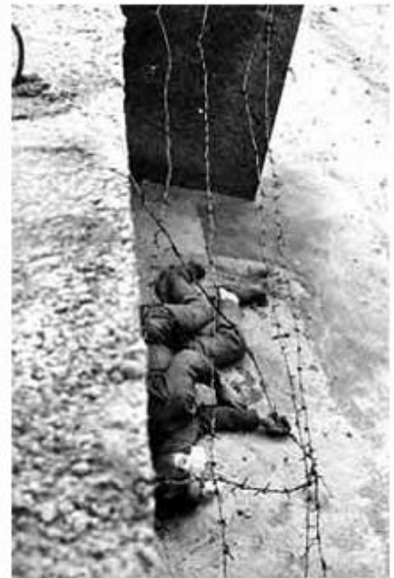
Peter Fechter dying next to the Wall ("Berlin Wall")

At first the “Wall” was not a wall really; rather a barbed wire barrier defended by soldiers (Hildebrandt 10). Two days later East German forces began construction of a concrete wall to replace the barbed wire. Seven checkpoints (the most famous of which is Checkpoint Charlie) were left for regulated traffic between East and West. East Germans continued trying to cross the Wall and some succeeded. Today at the site of Checkpoint Charlie there is a museum dedicated to these people, showing their wild escapes. These escapes include a 145 meter-long tunnels underneath the Wall (in operation from 1966 to 1971); a homemade hot air balloon flight over the Wall (1979); and cars retrofitted to drive under the bars of the border control, through the Wall, or smuggle people across the border (Hildebrandt). Some attempted escapees were not so fortunate as to succeed, however. The highest profile case was when 18 year-old Peter Fechter was shot in 1962 trying to escape (Waldenburg 114). He lay for 50 minutes bleeding to death just on the East side of the wall, in perfect view of horrified onlookers and journalists on the West side (Hildebrandt 52).