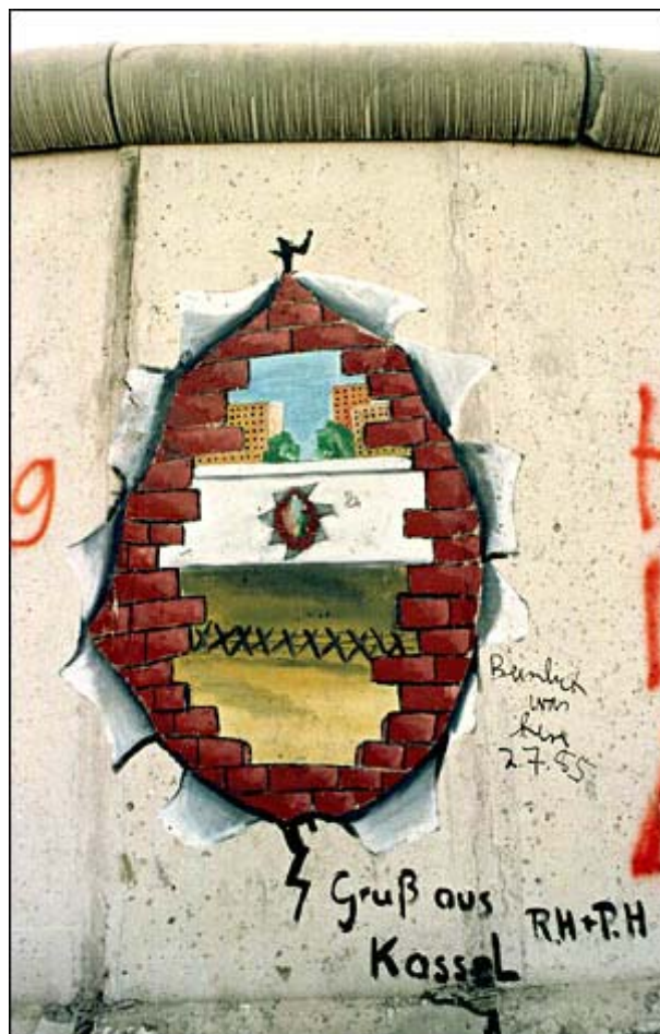
Figure 6 (Rosset Gallery 1)