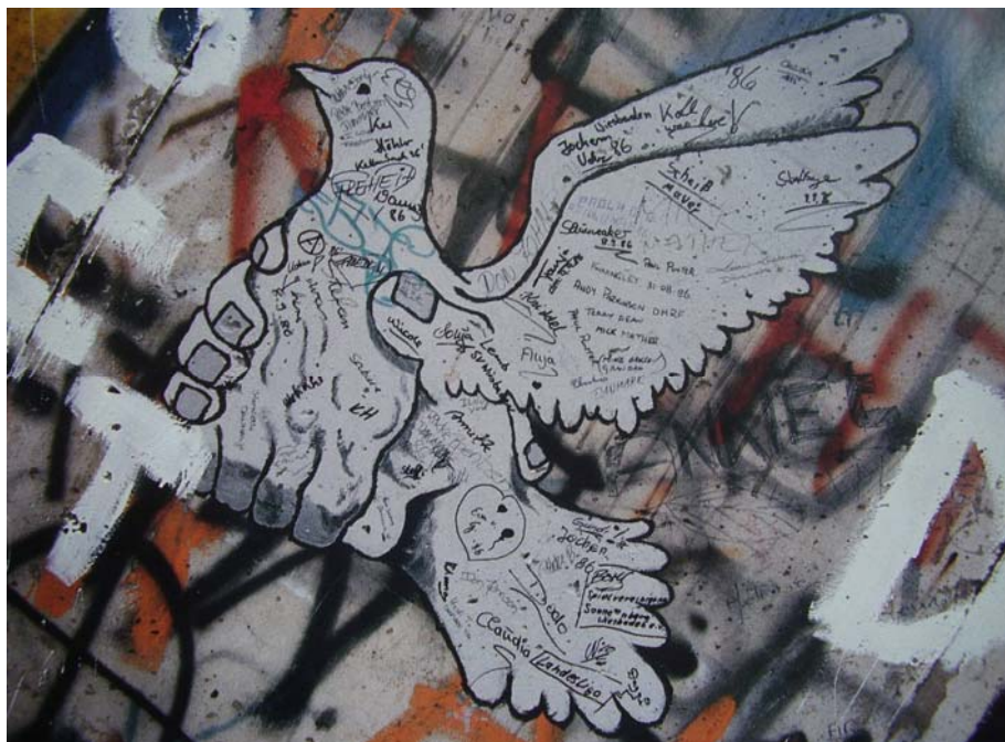
Figure 12 (Waldenburg 65)