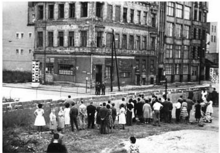
The block and mortar Wall in 1961 (Burkhardt)

landscape” of the West Berlin consciousness (Stein 85). There were several incarnations of the Wall after initial barbed wire was strung in 1961. First it became a block and mortar structure topped with barbed wire, then in 1963 it was replaced