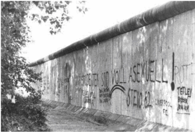
The fourth generation Berlin Wall (Pastemaci)

1975, construction began on the “fourth generation Wall,” and this structure was not complete until 1980. This time the DDR replaced the concrete slabs and the wire of the third generation wall with the familiar thick, smoothly jointed concrete wall. Instead of barbed wire to make climbing difficult, a large pipe was placed at the top. This is the Berlin Wall that is most commonly seen in pictures. It is this Wall that is truly