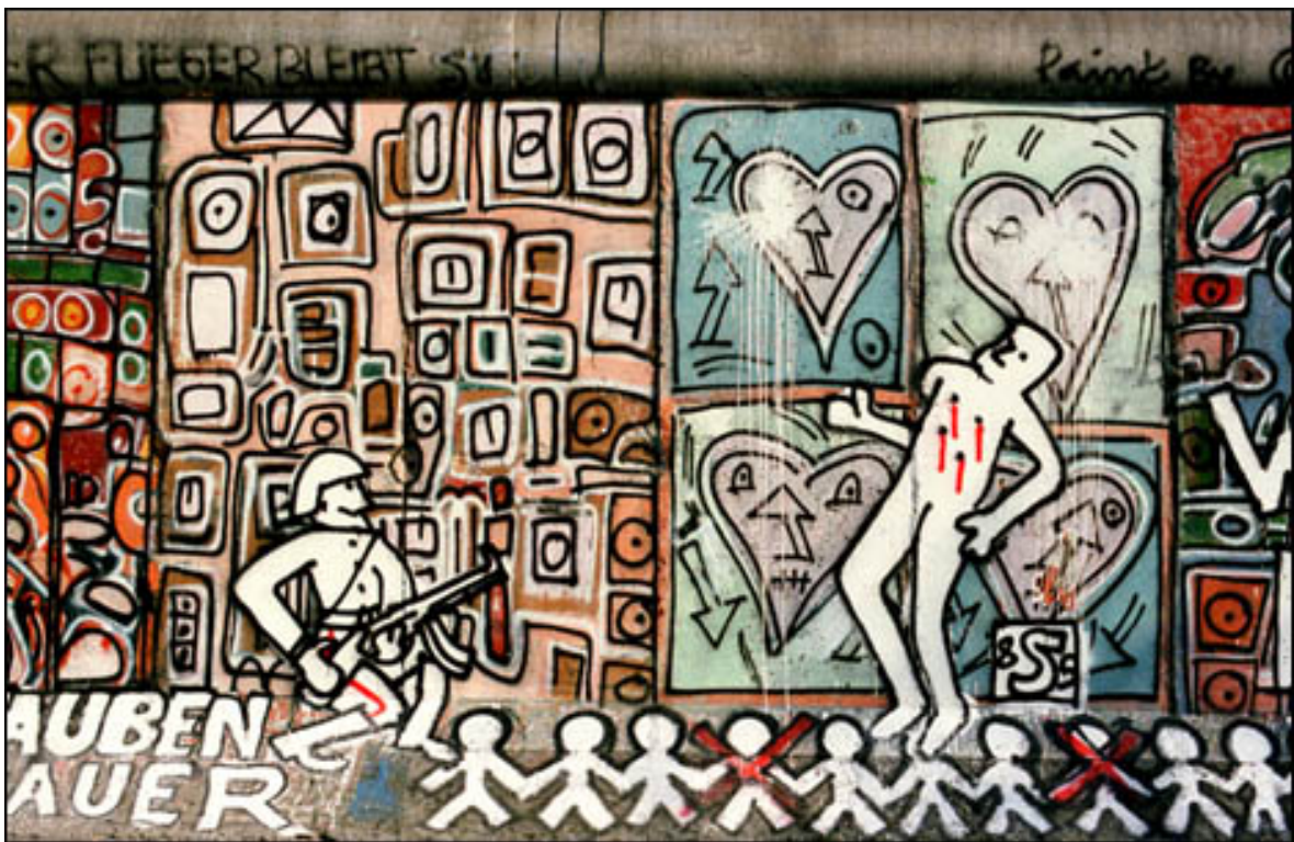
Figure 4: Piece by Thierry Noir (Rosset Gallery 2)