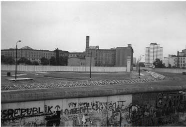
System of defense on the East side of the Wall (Flack)

adjacent. The death strip was punctuated with watch towers, manned by guards prepared to kill in order to “defend” citizens against succumbing to the temptations of the West. Barbed wire, smaller fences