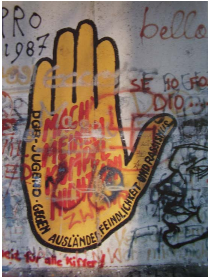
Figure 11 (Waldenburg 94)