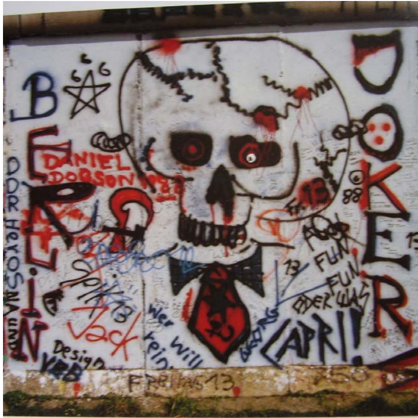
Figure 19 (Waldenburg 34)