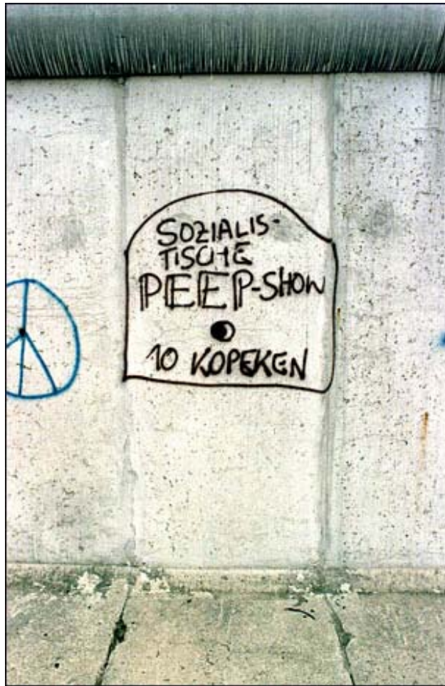
Figure 13 (Rosset Gallery 1)