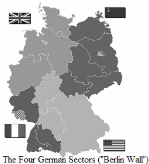
The Four German Sectors ("Berlin Wall")

bankrupt, starving, left crippled by a disastrous twelve year dictatorship and even more disastrous war. Whether this moment was truly a "zero hour" is debatable; however, it obviously had to be a change, a new beginning. The "German question," which had plagued Germany and its politics since the Napoleonic era, was back on people's minds, this time around the world. The Allies had to