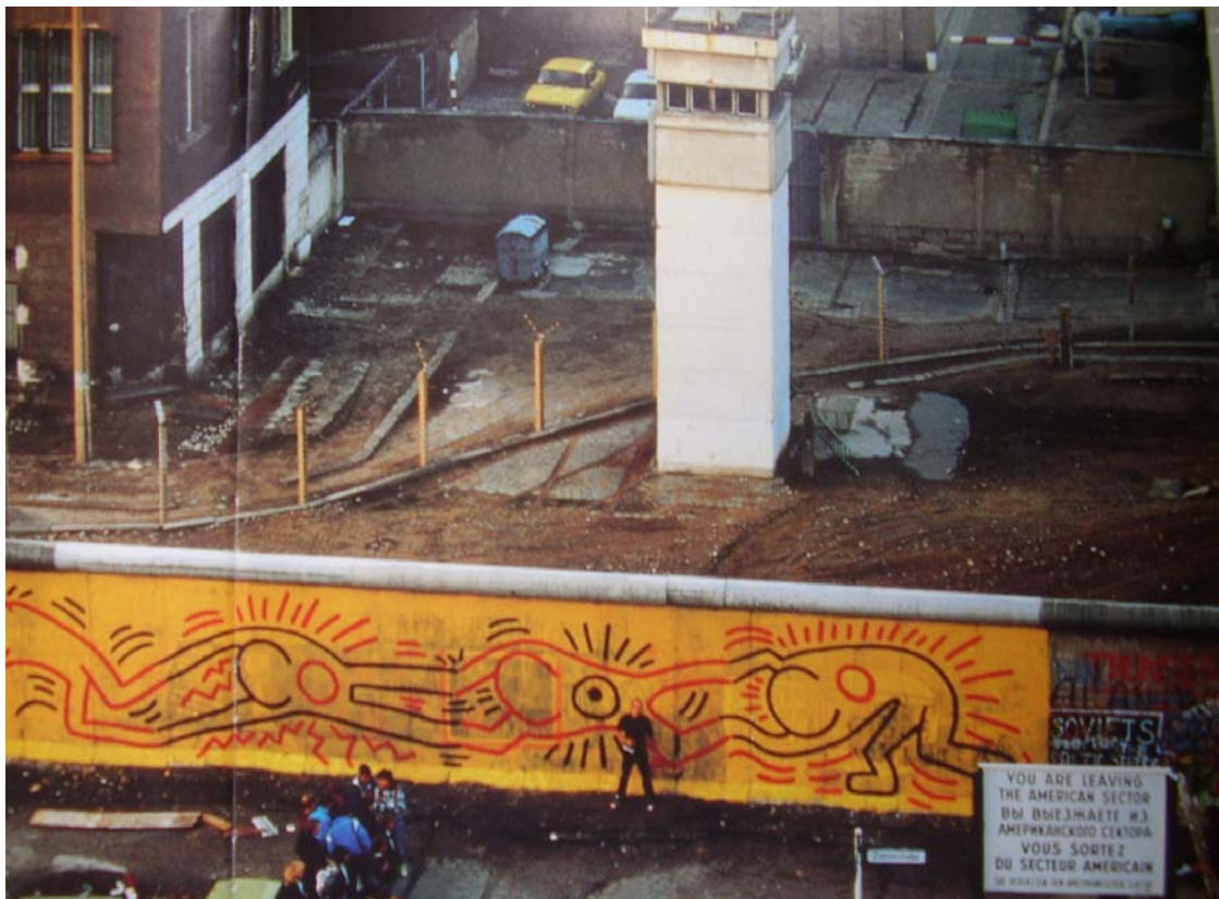
Figure 2: Keith Haring painting on the Berlin Wall (Waldenburg 6-7)