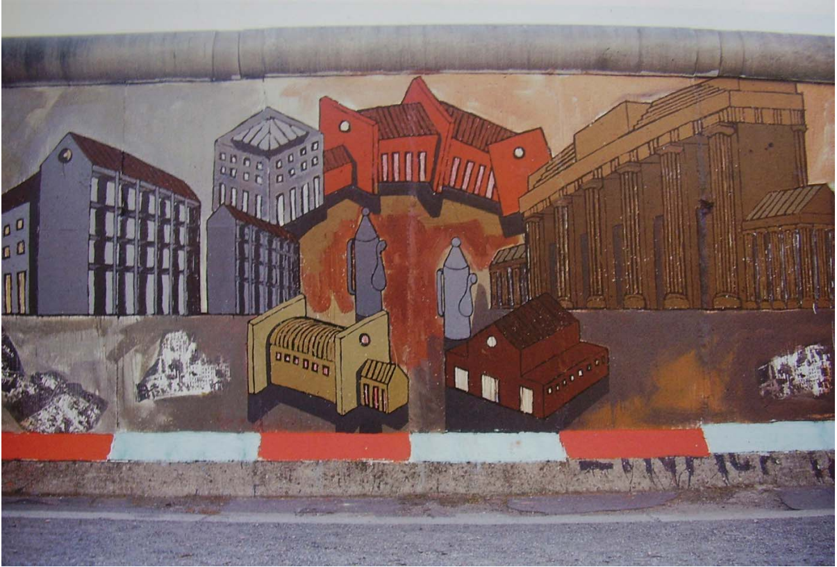
Figure 9 (Waldenburg 54)