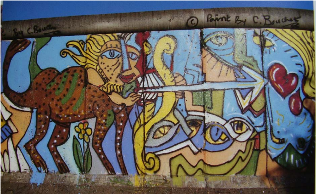
Figure 7: Piece by Bouchet (Waldenburg 24)