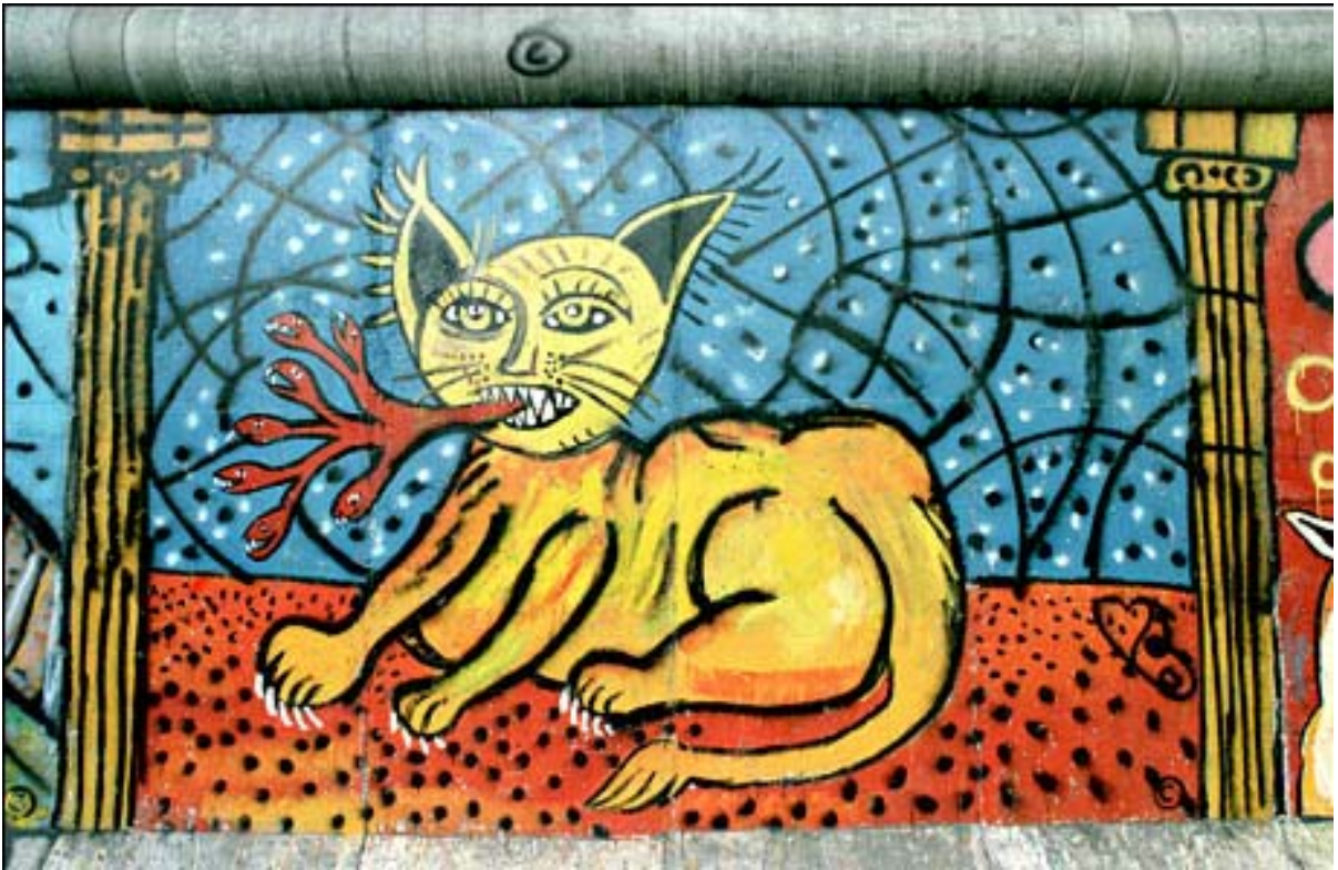
Figure 8: Piece by Bouchet (Waldenburg 31)