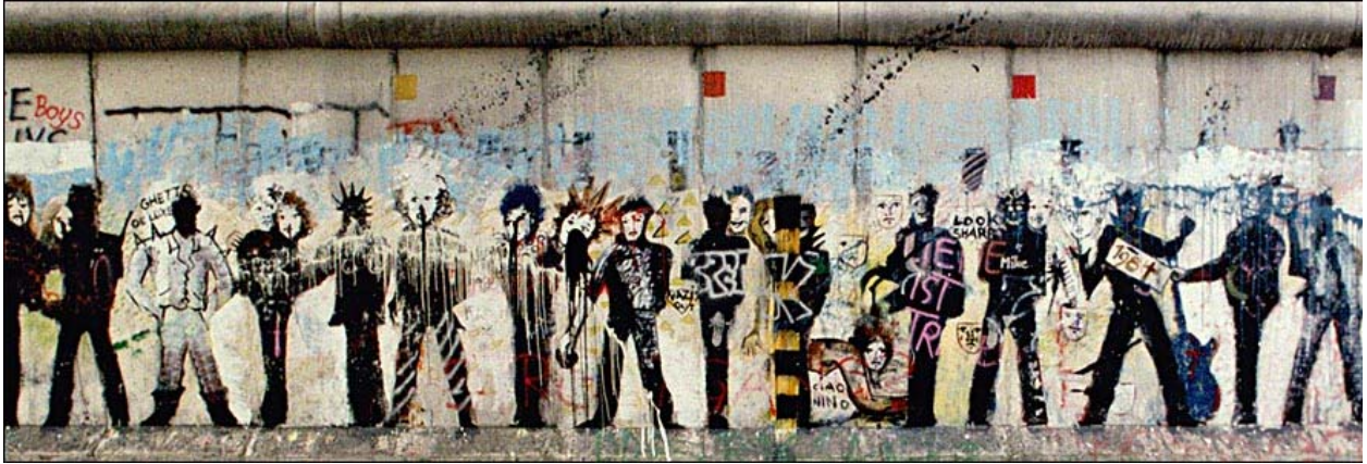
Figure 17: Shadow Figures by Hambleton (Rosset Gallery 4)