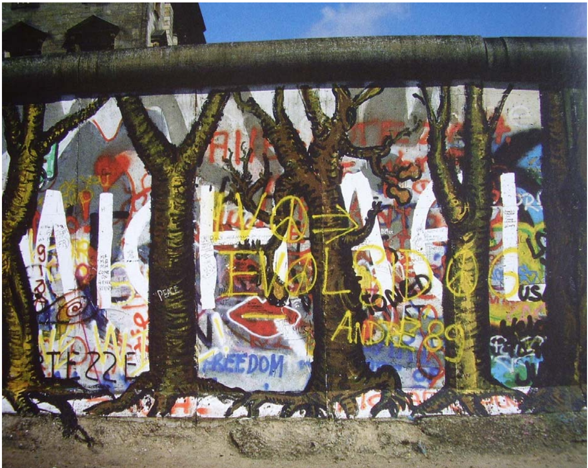
Figure 18 (Walden 74)