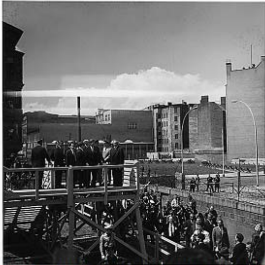
Kennedy's 1963 visit to the Wall ("Berlin Wall")

important. (Ladd 19). Adenauer, Kennedy, and Reagan were just a few of the important German and American figures to visit the Wall from the West side, and on the East side