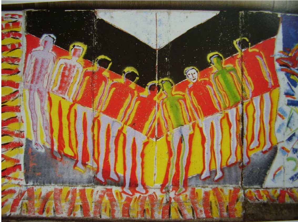
Figure 3 (Waldenburg 42)