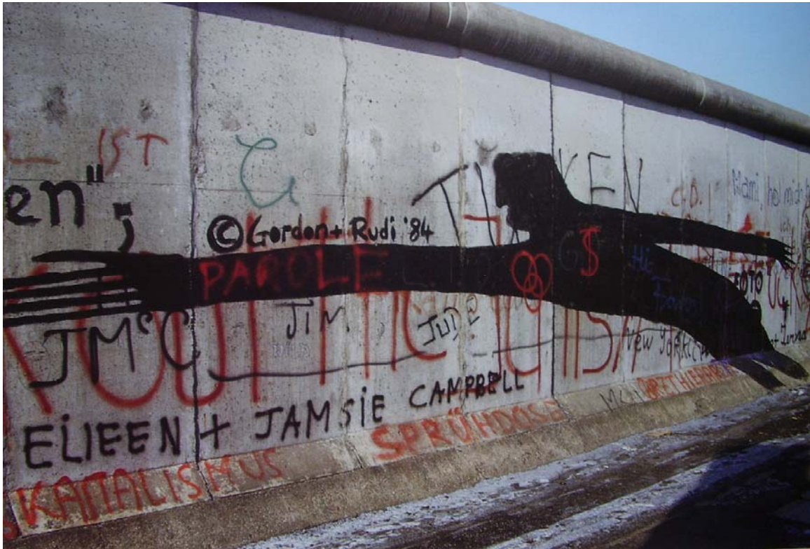
Figure 16 (Waldenburg 17)