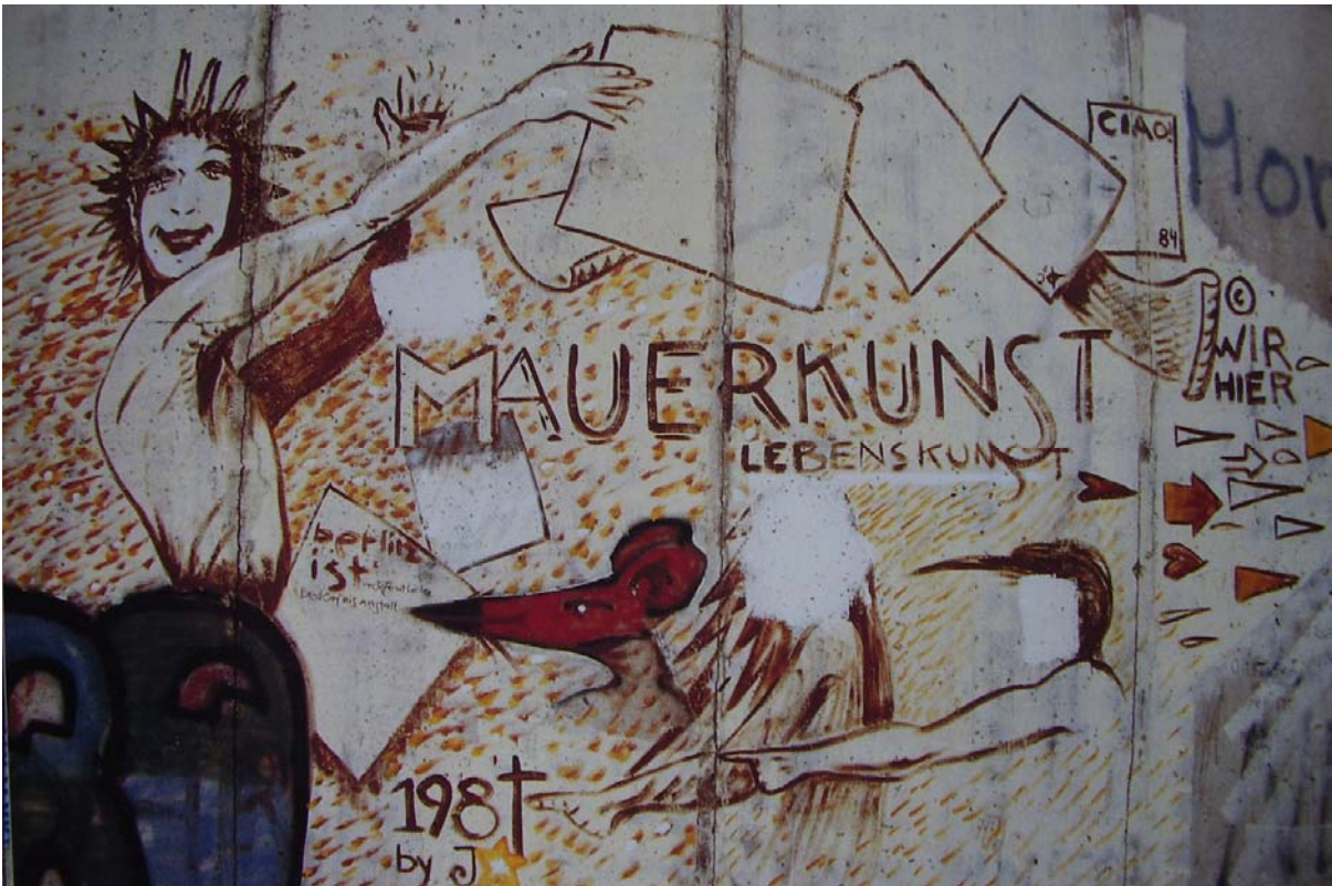
Figure 10 (Waldenburg 50)