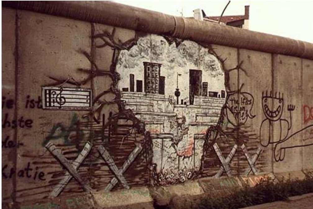
Figure 5 (Flack)