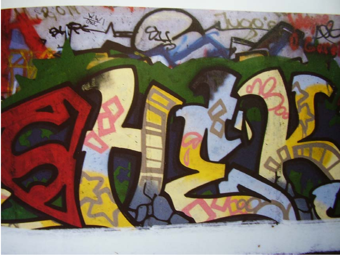
Figure 15: Hip Hop Graffiti (Waldenburg 87)