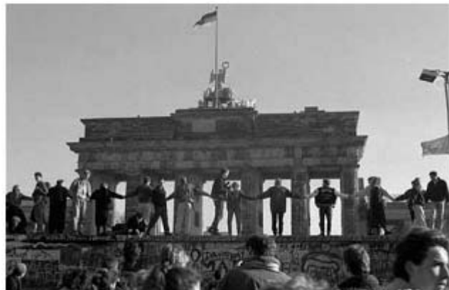
Berliners celebrating on Nov. 9, 1989 ("Berlin Wall")

Throughout the summer citizens began to mount more and more protests calling for freedom of movement. In September and October, several demonstrations were broken up violently by the East German police. People persisted, though, and demonstrations during Gorbachev's visit to the DDR and leading up to the large 40 th Anniversary celebration on October 11 showed that Honecker had lost his grip on the nation. On October 17, he was removed from his office of secretary-general. His successor, Egon Krenz reopened the border with Czechoslovakia, and 10,000 people poured out of East Germany and into the BRD between November 1 and 3. Then, on the evening of November 9 th , the Associated Press broadcast that the border between the