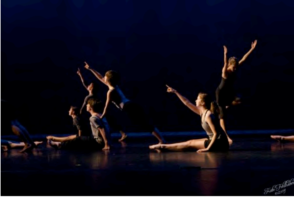
16. Dancers reach the diagonal pointing motif at their own times, linger there together, and decay from it at their own times.