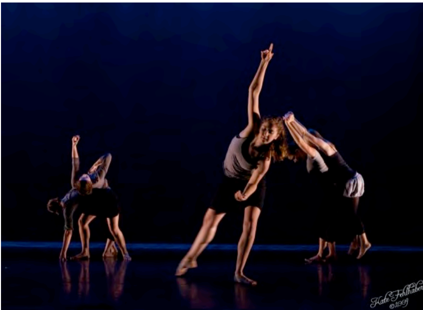
15. Partnering enters and exits the space, and a few dancers perform solo phrases.