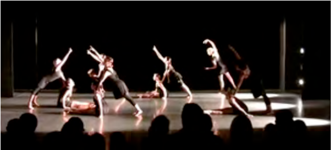
4. All crossing couples collect on the stage and reach out beyond their own relationships- first moment of "unison" in piece