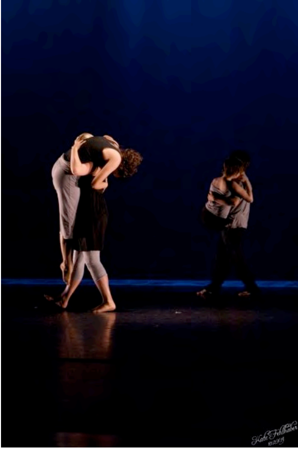
14. More tender partnering enters the space.