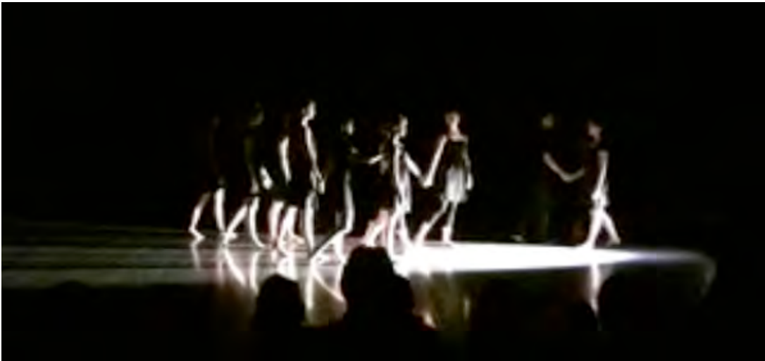
1. Original passage across stage; exploration of individual choices and sensitivity through time and space.