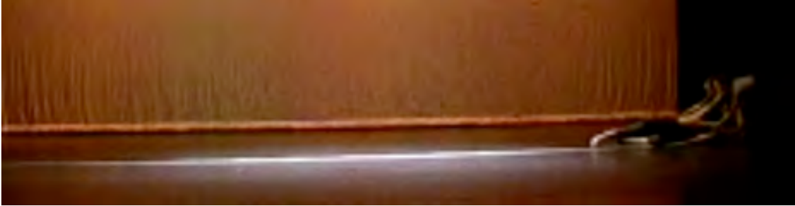
22. As she reaches the wing, many arms reach out to pull her off stage.