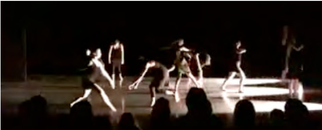
2. Chaotic breakdown: exploration of boldness and individualism in a crowded space.