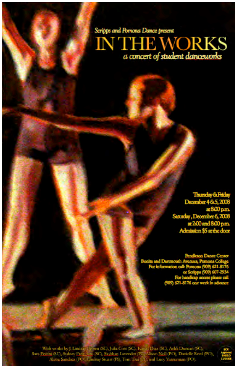
Scripps Dances Poster, Spring 2009