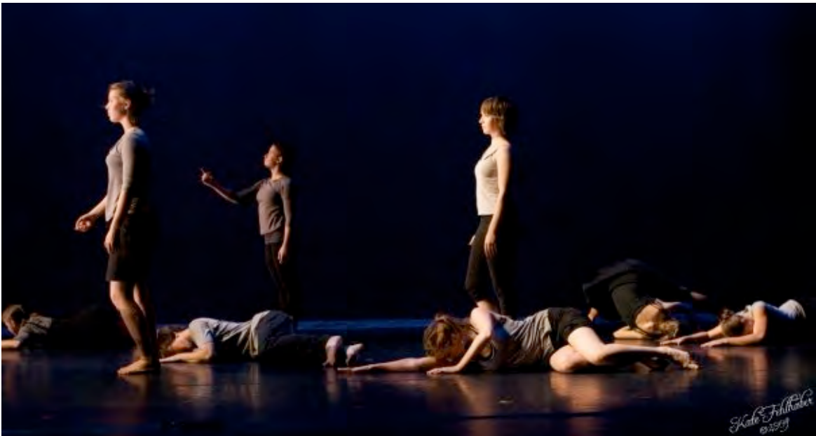
17. Dancers either crawl or slowly walk off stage.