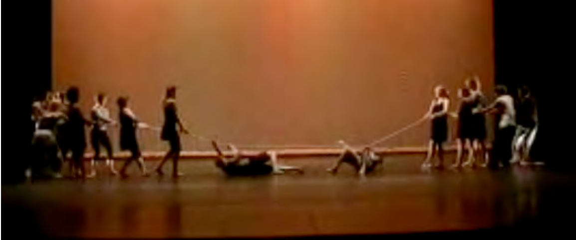
4. Episode 4 (Tug of War): Alyssa and Alissa cross to the opposite sides of a tug of war.