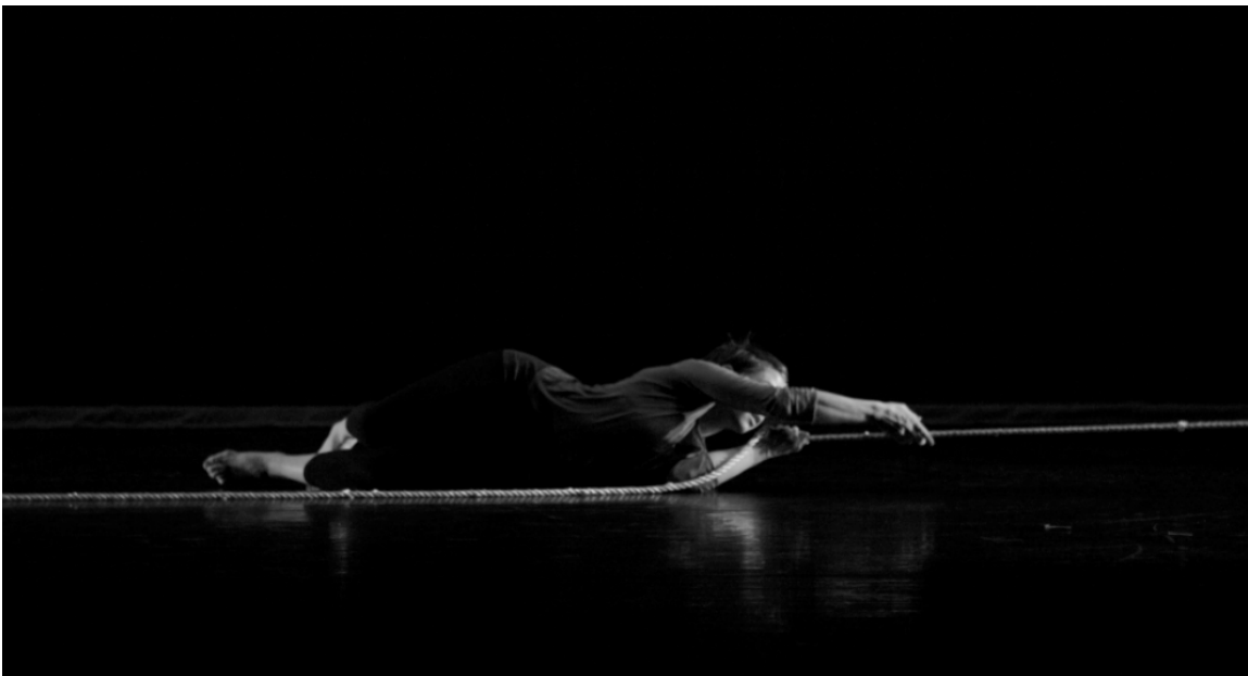
21. After the group exits, Charlotte pulls herself along the rope after them.