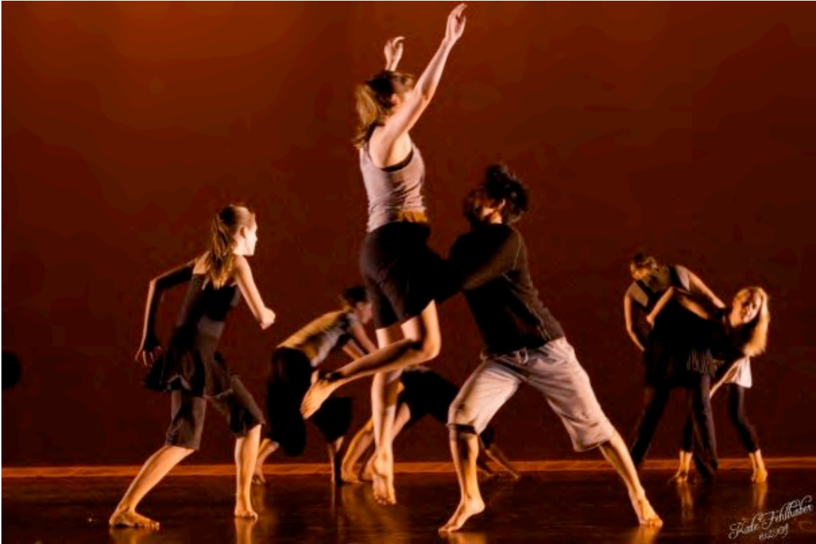
12. Chaos reaches an intensity as dancers run, perform aggressive moments of partnering, and snippets of a fast solo phrase.