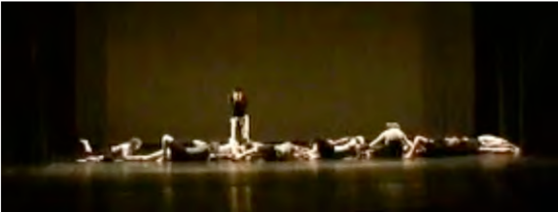
1. Episode 1 (Highway): Dancers crawl along the rope while Tom emerges.