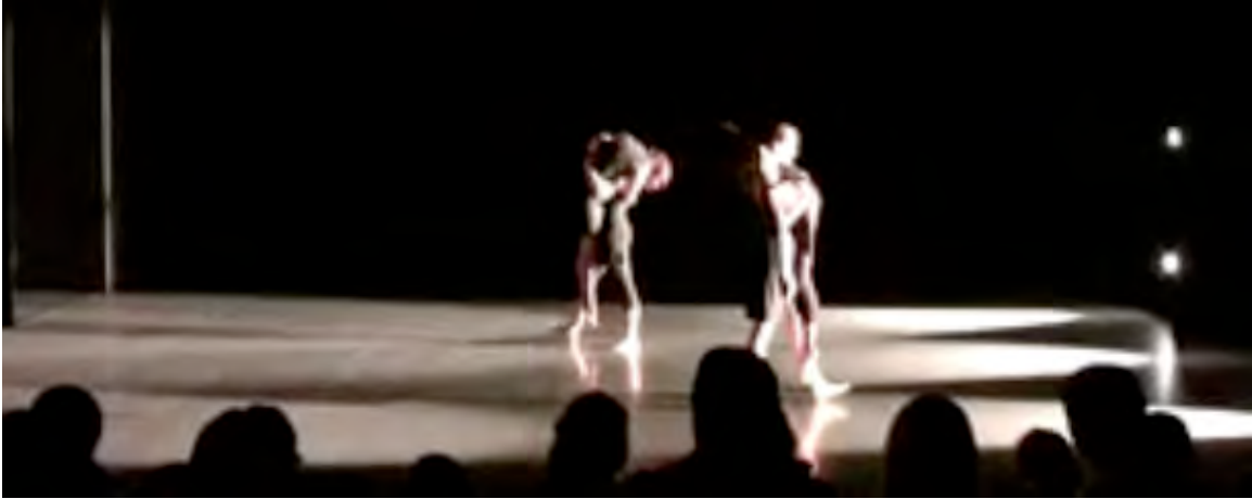
3. Exploration of generosity and sensitivity of two selves, supportive interactions that enter and exit the space