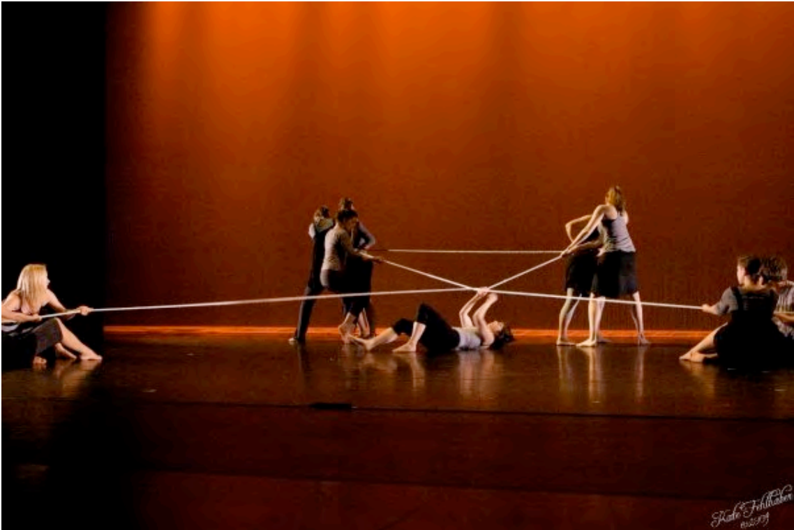
5. Episode 5 (Intersection): Gigi and Charlotte pull themselves across the intersection.