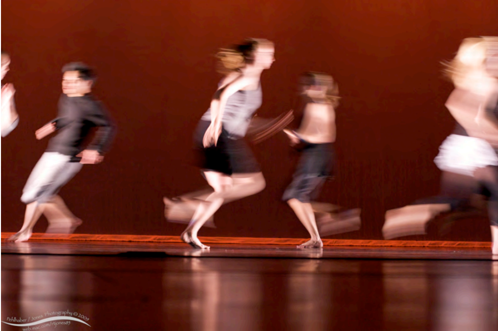
8. The “Chaos section” begins with dancers sprinting onto the stage.