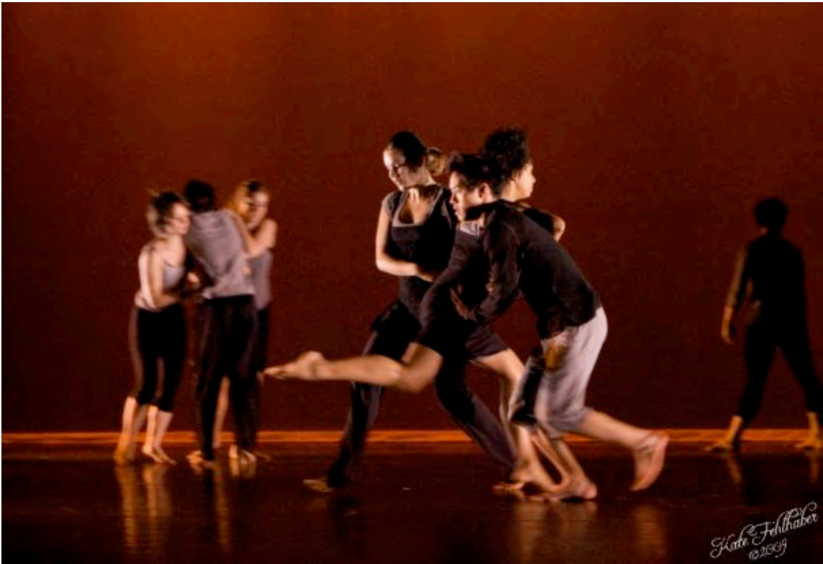
11. Further fragmenting into trios.