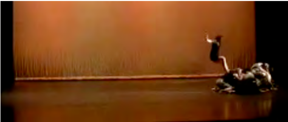
9. Dancers make a “boulder” and Lucy jumps onto them, and they sit up to throw her off of them.