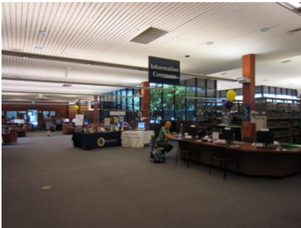
Information Commons Desk with directional sign above