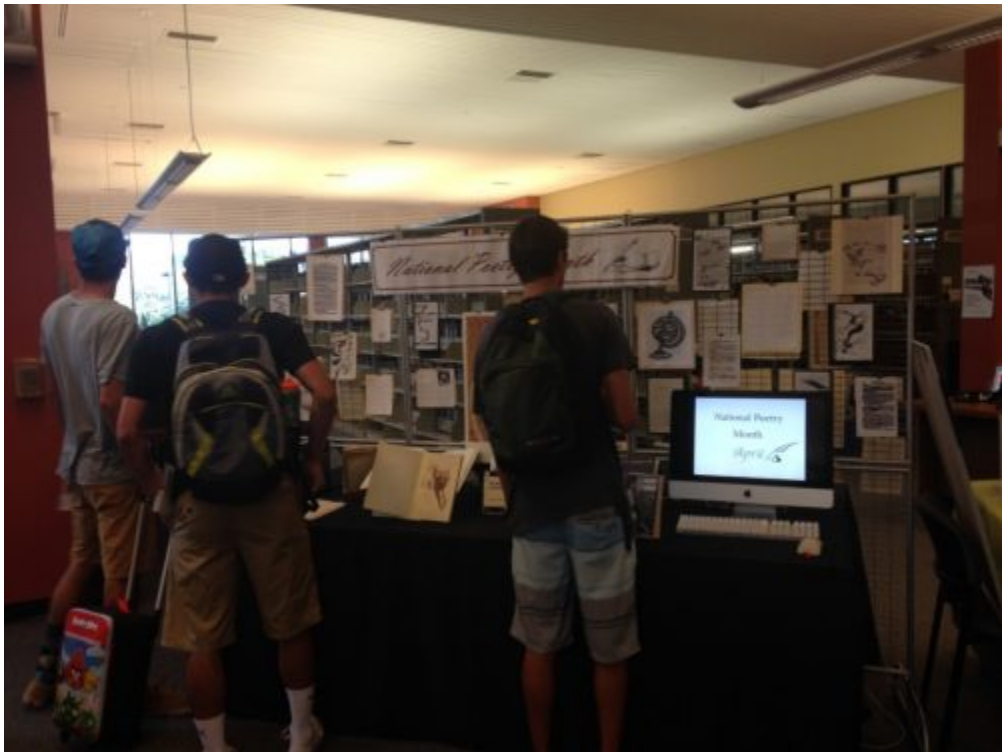
Adding new work to the April National Poetry Month display