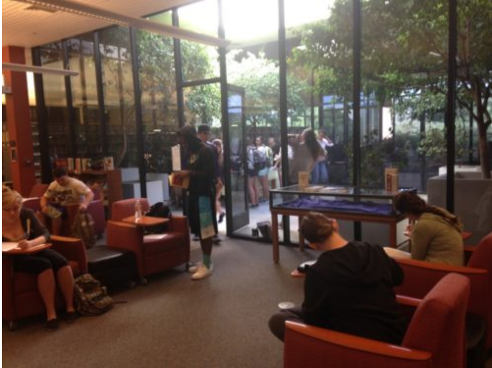
Students writing poetry inside and outside the atrium, our "Idea Box" of sorts at Pearson Library