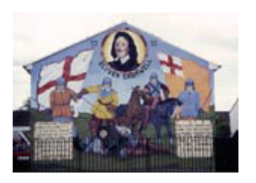
Loyalist mural, Shankill Parade, West Belfast, 2002, in the CCDL

at which it was painted and its location, and-most importantly—to give a description of the image which tells something of its historical significance. This meant not only using my own notes, compiled as I took the photographs over the twenty five year period, but checking my notes and memories against official forms of historical record—maps, newspaper archives, biographies and histories, online resources,