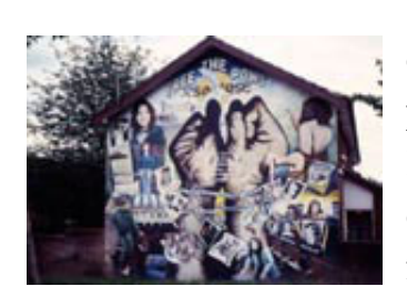
Republican mural, New Lodge Road, New Lodge, Belfast, 1997, in the CCDL

archive unique as a historical resource—and gives it political significance—is the fact that although there are other collections of images painted after the end of the violence in 1996, this is the only digital archive which includes a large number of the murals from the period 1979 (when the murals first started to appear in a significant way) to 1996. In that sense this is the sole record of the development of the murals as an important medium by which the political conflict in Northern Ireland was represented and indeed fought out.