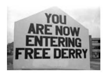
Republican mural, Bogside, Derry, 1989, in the CCDL.