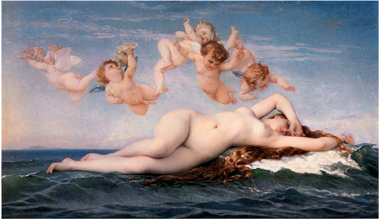
Figure 4-- Cabanel's La Naissance de Venus (1864)