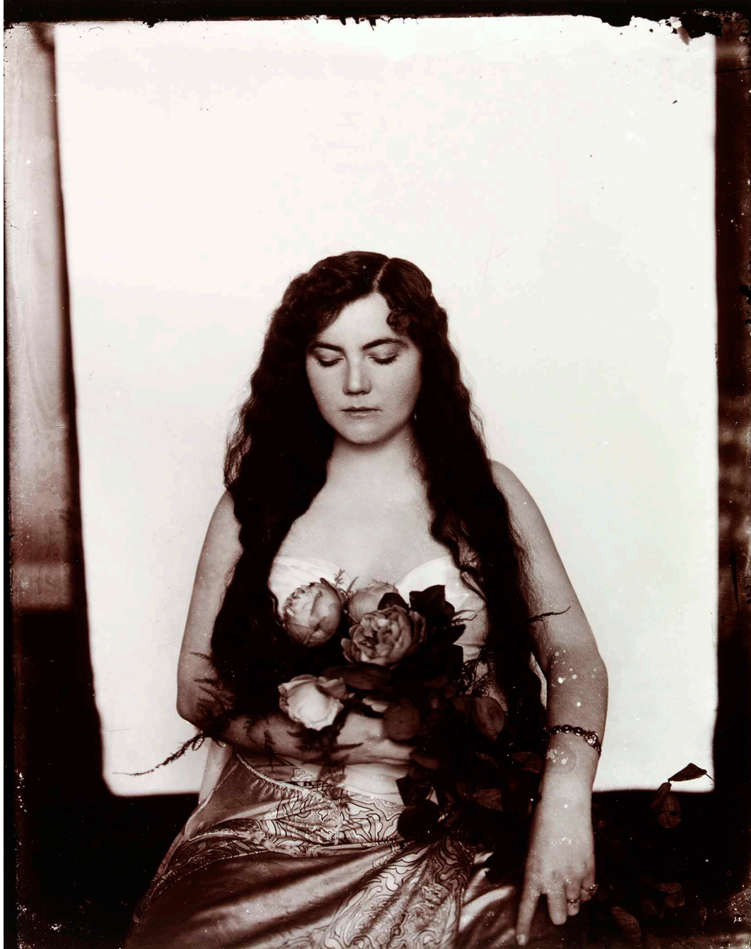
Figure 6-- Friedlander's Plate 4 (thought to be Lulu White)