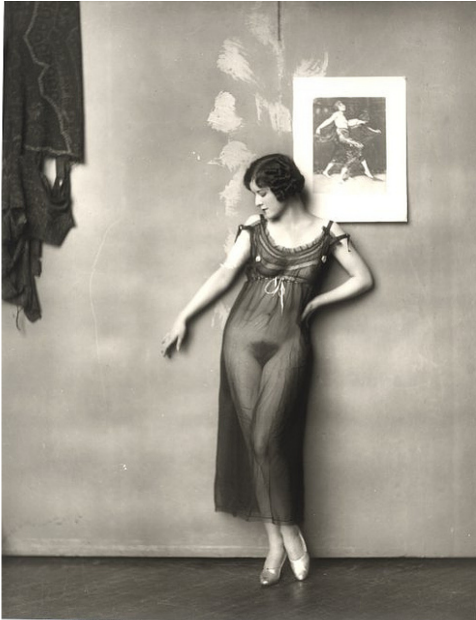
Figure 9-- unnumbered Bellocq print