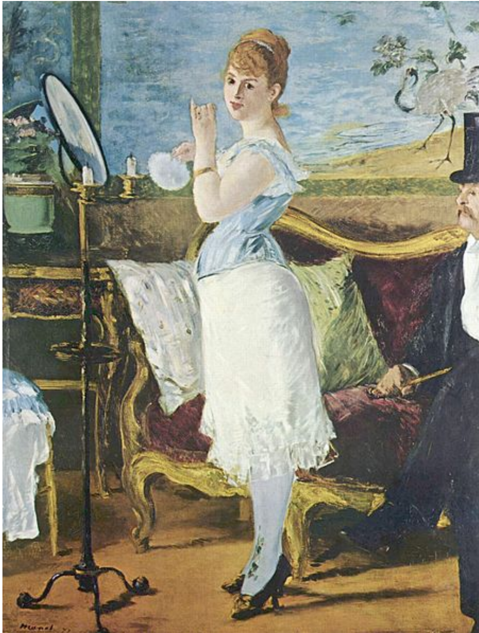
Figure 7-- Manet's Nana (1877)