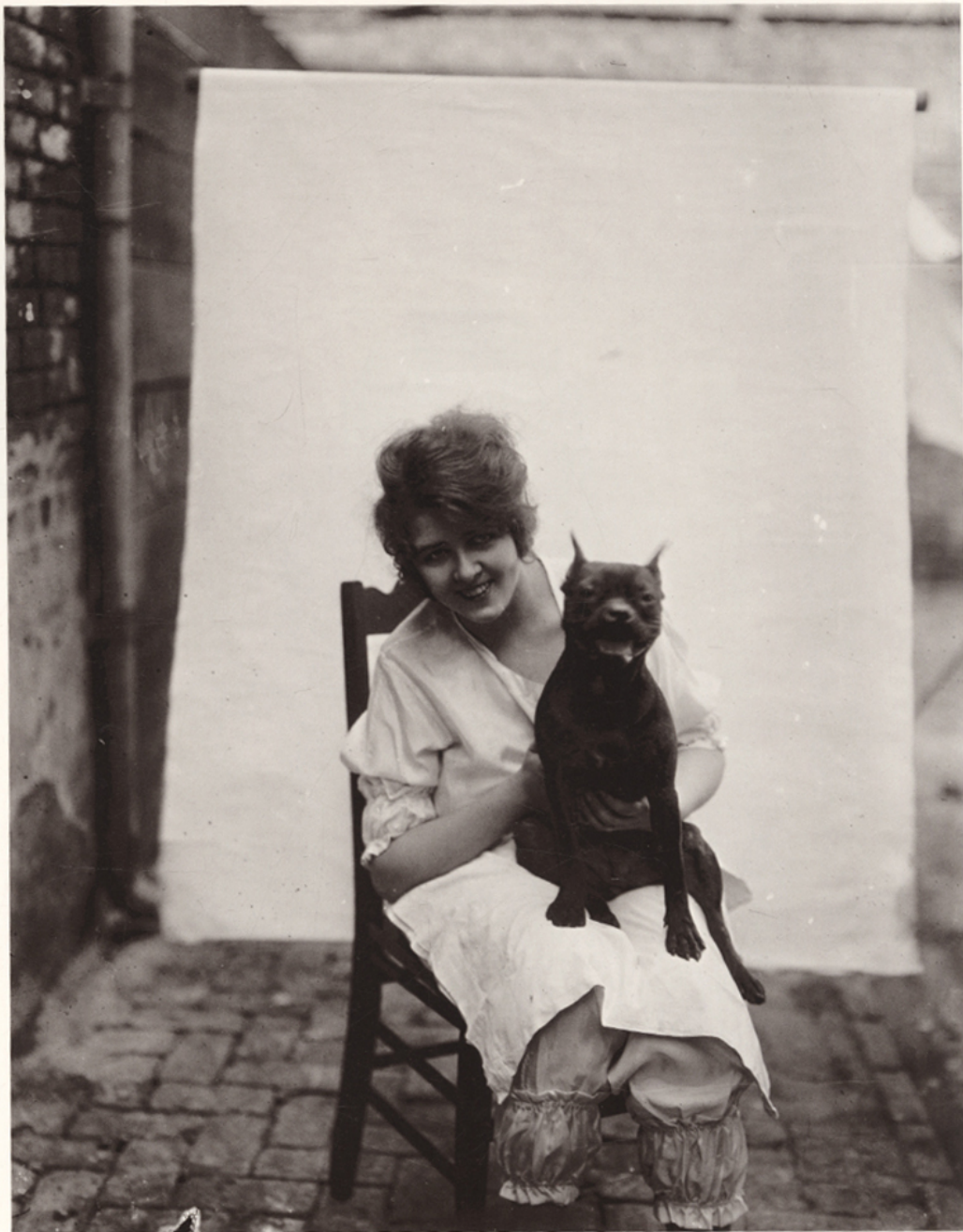
Figure 2—Friedlander's Plate 3