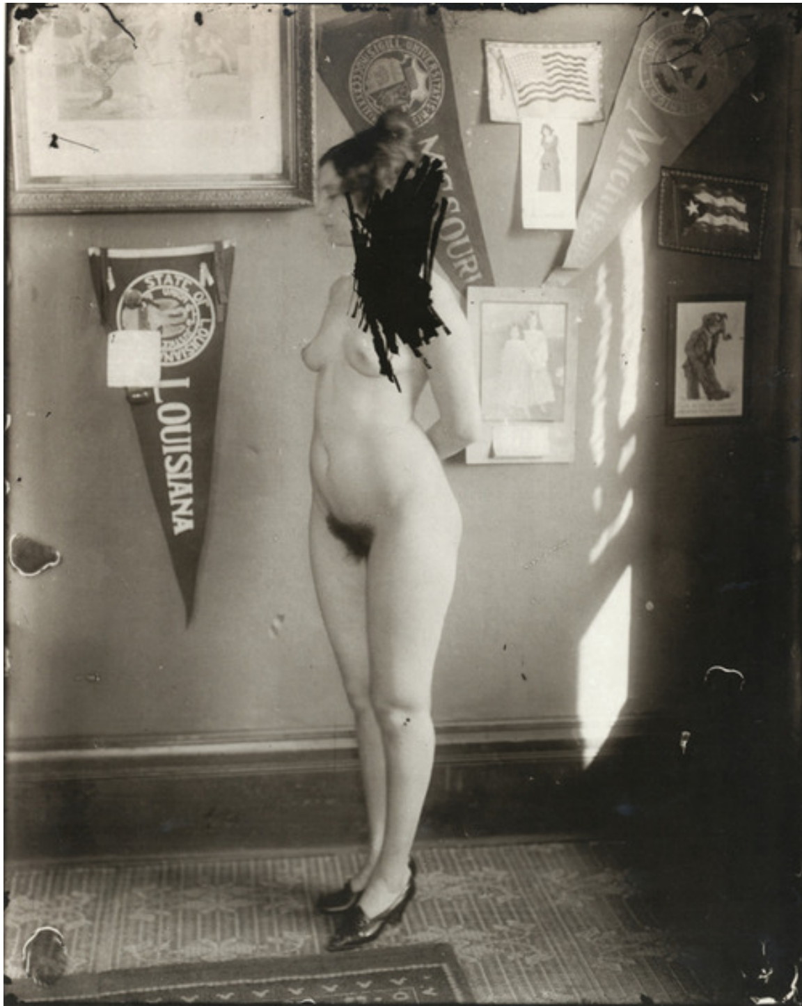
Figure 5-- One of many examples of the ubiquitous university pennants present