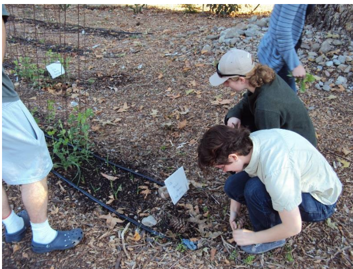
Students prepare to maintain the group plots during the independent study course in fall 2013.

The final subset of topics was chosen in part based on the results of the fall 2013 survey, in which students were asked to select all topics they would be interested in studying. 196 The course culminates in an independent final project on a topic of one’s own choosing, so that students