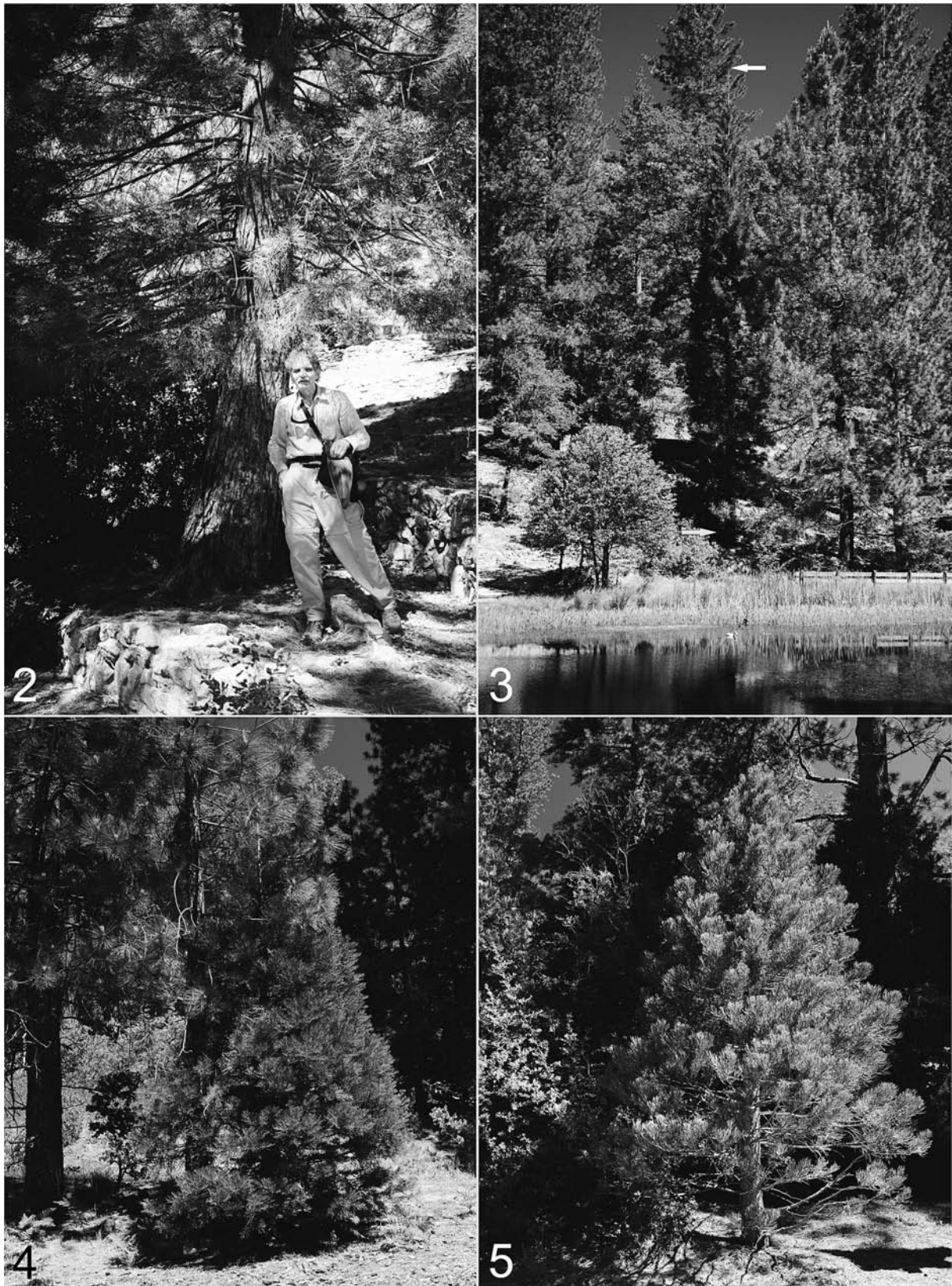
Fig. 2–5. Sequoiadendron giganteum at Lake Fulmor (1625 m el.), northwestern San Jacinto Mountains, Riverside Co., California (see Fig. 1 for locations of trees).—2–3. Parent tree (#2r) 45 cm DBH, ca. 20 m tall, ca. 35 years old, with Rudolf Schmid. Arrows indicate top and bottom of tree; note the long leader.—4–5. Entirely vegetative offspring (#1, #3) 5 and 3.5 m tall, respectively. (Photos taken 19 Jun 2012 by M. Schmid).