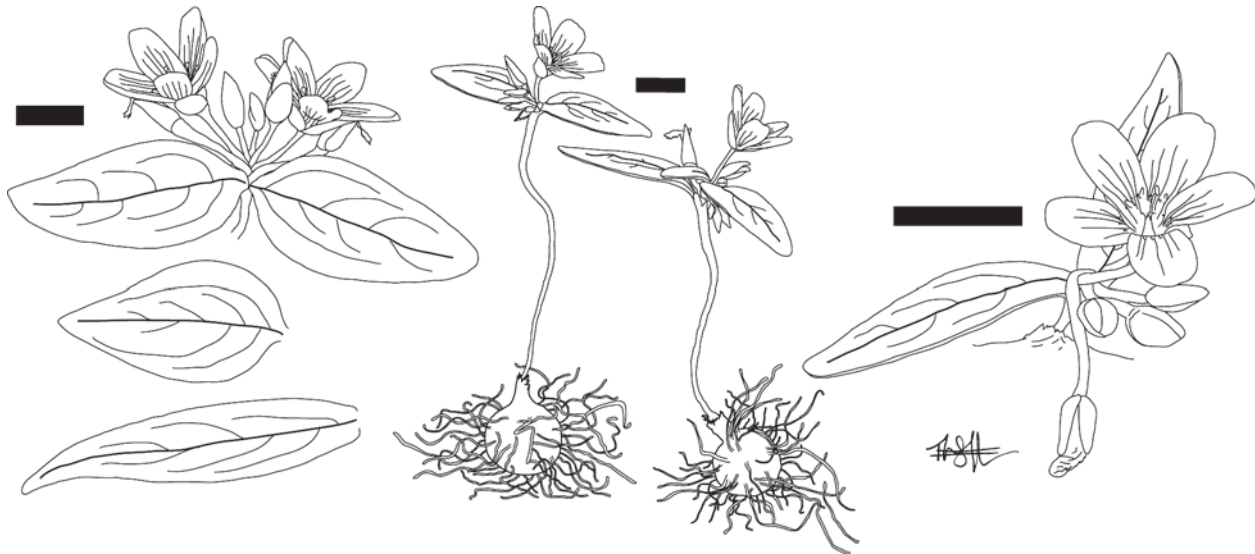
Fig. 10. Line drawing of Claytonia lanceolata var. peirsonii . Note the short above-ground stem, and variation in leaf shape. The variety differs from many members of the C. lanceolata complex by having entire (as opposed to notched) petals, but in common with other members its flowers have pink veins and yellow spots at the base of the petals. Generally, plants in the San Bernardino Mountains have narrower leaves than those in the San Gabriel Mountains from which the variety was originally described. All scale bars = 1 cm. Line drawing by first author.

Given the various issues in taxonomic research more broadly discussed by Venu (2002), we think that some subtle, yet informative, taxonomic characters exist for the southern populations of C. lanceolata that may be obscured during the process of making herbarium specimens. Aside from the ecological setting, the majority of characters most readily used to distinguish this species are undoubtedly best observed in the field, including inflorescence architecture, floral morphology, and cauline leaf shape.