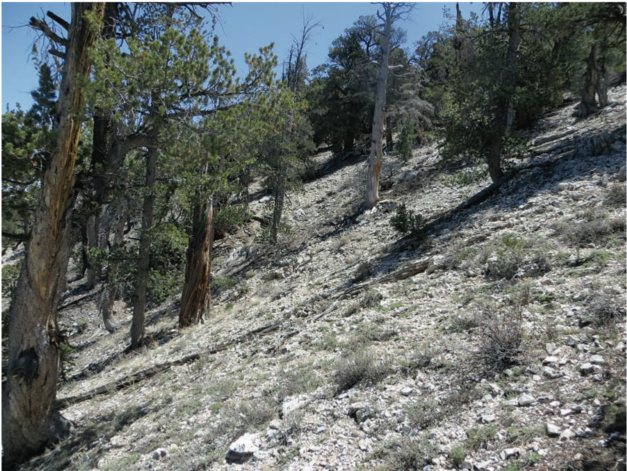
Fig. 3. Habitat of Claytonia lanceolata . Photo taken on the north slope of Bertha Ridge in the San Bernardino Mountains, southern California, near the initial discovery site of C. lanceolata var. peirsonii . White dolomite rocks characterize the landscape that is dominated by open woodland of both Pinus flexilis and P. monophylla , along with Juniperus grandis . Plants occur in dense populations on these steep hillsides underneath the shade of trees in heavy duff as well as in open sun amongst rocks.

1995; Soza and Boyd 2000; CPC 2010; CNPS 2013) suggest that C. lanceolata var. peirsonii is typically found blooming next to melting patches of snow on north-facing slopes, often in open sun amongst rocks (Fig. 3) or in shady areas with dense conifer litter (not pictured). At a more inclusive level, this taxon is described as occurring on unstable talus below ridgelines in lodgepole forest or upper montane, mixed coniferous forest habitats. Claytonia lanceolata var. peirsonii is on CNPS list 3.1, which means “needs review, but seriously endangered in California” (CNPS 2013). The purpose of this manuscript is to provide a review of the literature and draw together observations made in the field and from herbarium specimens so a more appropriate conservation status can be formulated for populations in southern California that meet the description of C. lanceolata var. peirsonii .