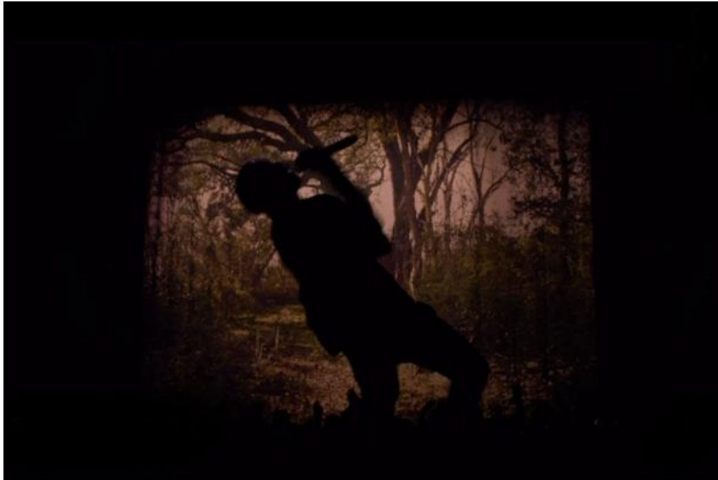
Figure 3 Kanye West performing "Blood on the Leaves" at the 2013 MTV Video Music Awards

Certainly, Kanye is making explicit, through a weaving of visual and narrative tropes, that the spectacle his life has become is akin to the spectacle of lynching. In the rest of the songs, West argues that money, drugs and fame are just as destructive, in a white supremacist culture that consistently denies West of humanity, than abject poverty. Again, Kanye believes that narrating the black body from property (slavery) to spectacle (celebrity) does nothing to address racism, but rather maintains a system in which African Americans are unable to lay claim to their own bodies. When West repeats the lyrics "Came out of your body", in reference to his unnamed girlfriend taking drugs for the first time, it feels as if West is pining for transcendence, to be valued for something beyond his physical form. Perhaps this is why West chose to signify upon the Trinitarian Incarnation, pronouncing himself both as a god ("I am a God") and as Christ. West aims to disentangle the notion that working against white supremacy means either sacrificing or limiting oneself to purely the profane body. West's vision is one in which his body,