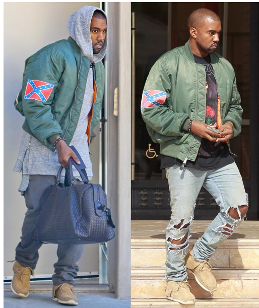
Figure 2 West sporting a bomber jacket with the confederate flag