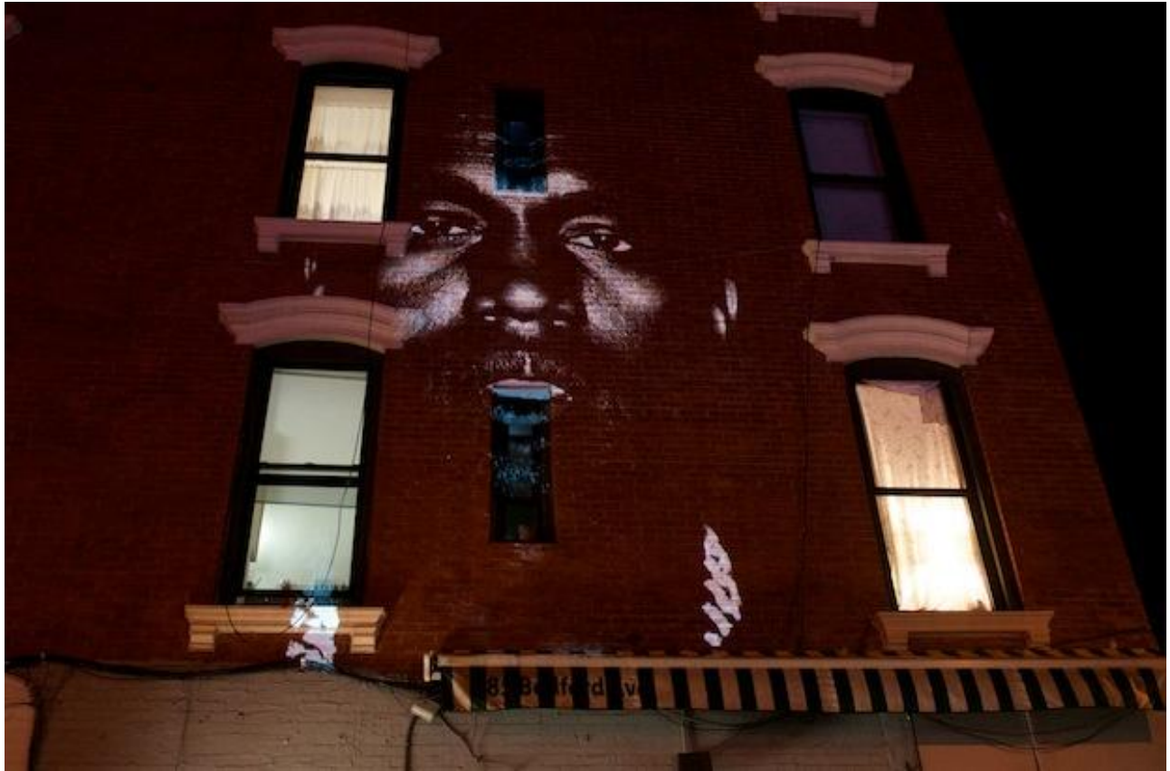
Figure 1 Kanye West debuting "New Slaves" on the side of an apartment building

The emphasis on provocative visuals continued with West's second single, "Black Skinhead". The song, a stomping battle-cry anthem complete with West himself shrieking, relies heavily on cacophonous percussion and deep synthetic chords. Again, the dark and electric sonic affect displayed in "New Slaves" promulgates the arrival of dogmatic Kanye, churning rage and proclamation into condemnation.