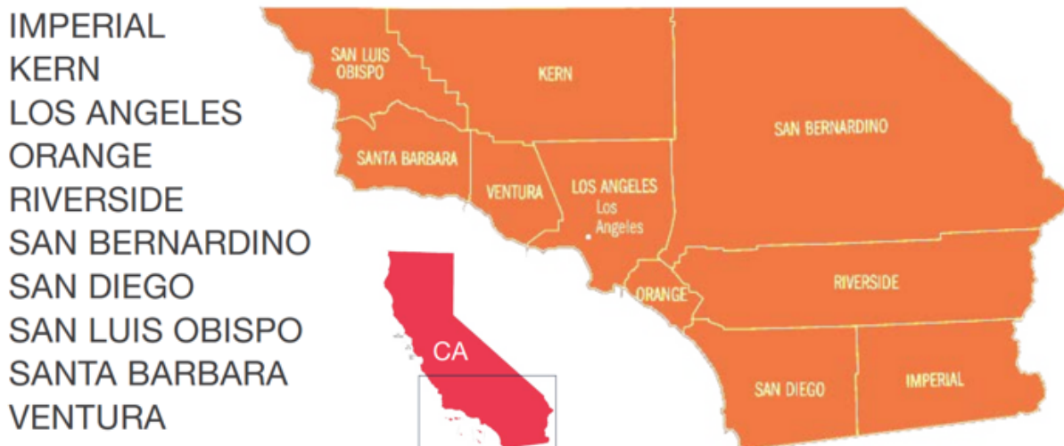
Figure 1. LA Regional Foodshed as defined by the LAFPC.

The Los Angeles regional foodshed (or the LA foodshed) spans a 200-mile, ten county radius from the Los Angeles urban core. These counties include: