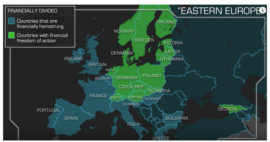
Image taken from The Economist video: "Is it time to scrap 'Eastern Europe'?" Financially solvent states are marked in light grey. Debtor nations are marked in dark grey. (retrieved from https://www.youtube.com/watch?v=ya55Q-WdIrQ)