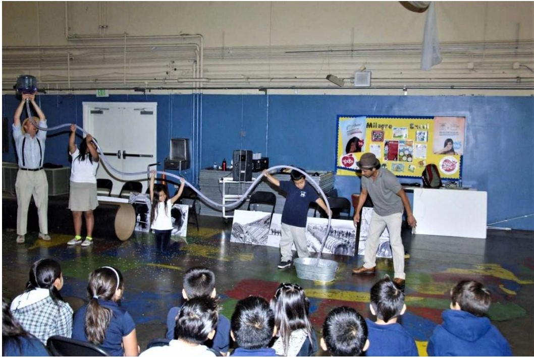
Figure 3. Students demonstrating how water can be made to flow uphill