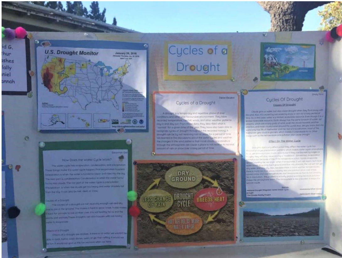
Figure 1. Visual display about understanding causes of drought.