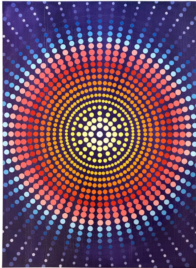
Figure 1. Author's painting titled, Icarus (2016)

I have long admired the way artists incorporate dot patterns in their work. The Pop artist Roy Lichtenstein's use of Benday dots, the spot paintings of contemporary artist Damien Hirst, and the teeming speckled environments found in the installations of Yayoi Kusama. The dot patterns that emerged in my paintings a few years back eventually settled into circular shapes that radiated out from the center of the works. The circular arrays anchored the compositions and freed each painting from a fixed vertical or horizontal orientation. Although my paintings were optically charged, I felt they lacked the dimensionality that I found intriguing in the works of other artists whom I admired.