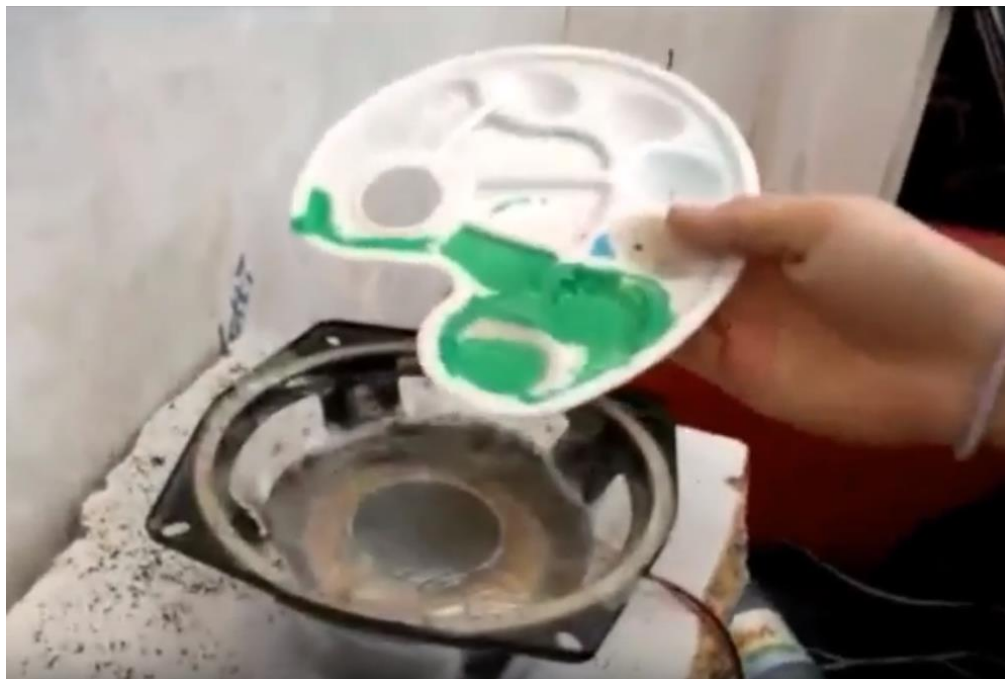
Figure 3. Soundwave Painting project by Hungarian students

In their SOUND WAVE project, the team of Szilágyi Erzsébet High School from Hungary have merged physics and art – they experimented with sound waves and how to paint with them, see Figure. 3. Similarly, this was subsequently featured in a CHAIN REACTION project, which can be seen at: https://kiks-microbit.wikispaces.com/Chain+Reaction