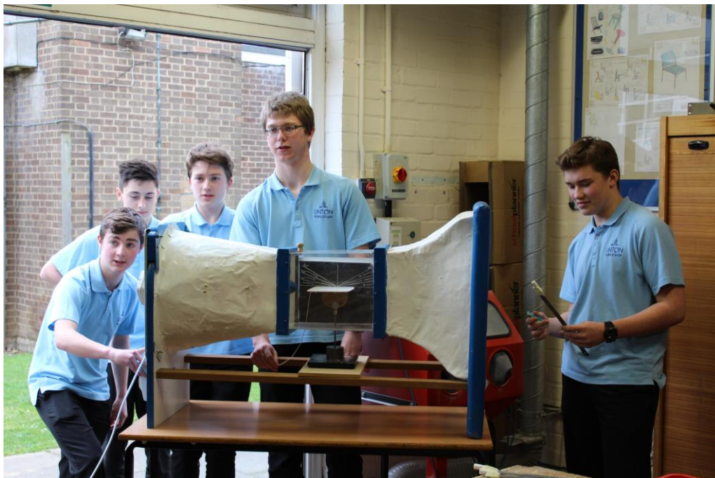
Figure 2. Wind Tunnel Development for aircraft wing test by English KIKS students from the Linton Village School, Cambridge.

The students develop their idea back in school supported by teachers and other experts. This example shows a WIND TUNNEL development which was subsequently shown to the international audience and led to ideas for more accurate computer control features of the tunnel, see Figure 2.