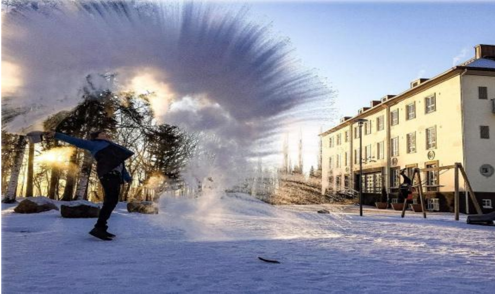
Figure 1. Artistic documentation of a spectacular experiment by the Mankola School, Jyväskylä: water freezing in midair at -20°C.