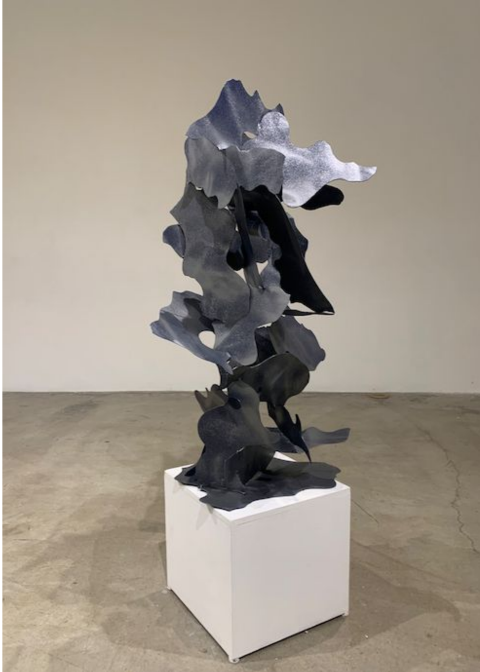
Lucy Manalo Climbing Camo 4' x 2' Plasma cut and welded steel, paint 2019