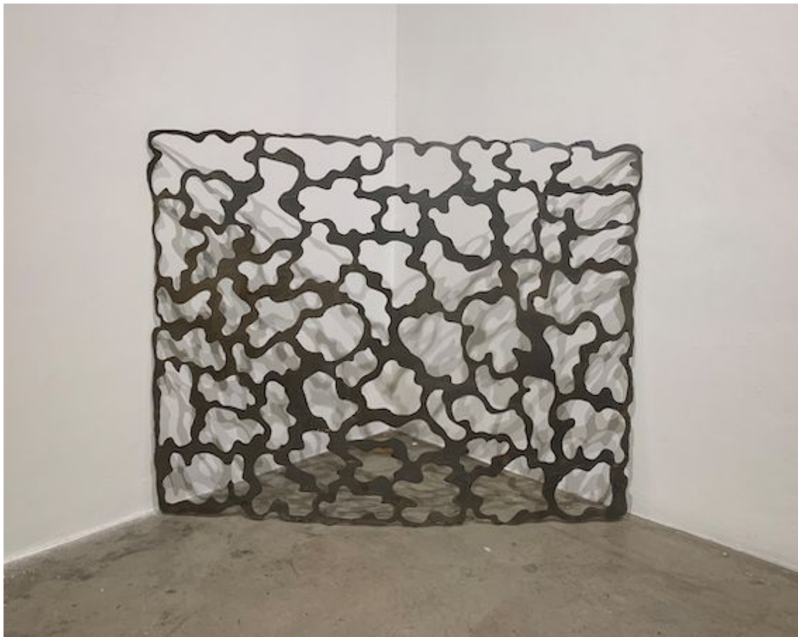
Lucy Manalo Camouflage 1 4' x 5' Plasma cut steel 2019