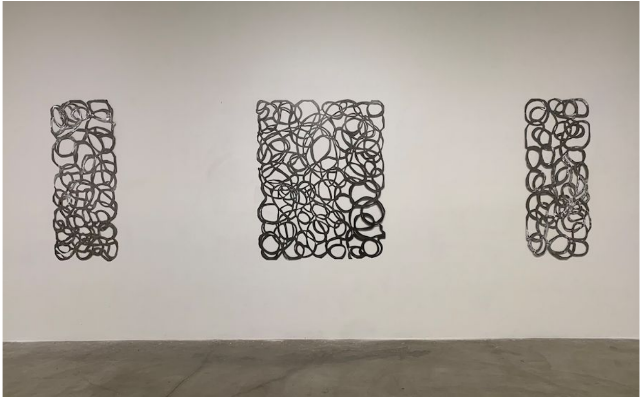
Lucy Manalo Abstracted Camouflage (1, 2 & 3) 2' x 4', 4' x 5', 2' x 4' Plasma cut steel, soapstone 2019