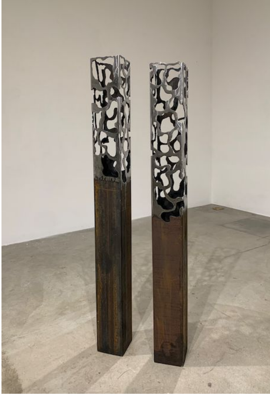
Lucy Manalo Morphing Metal Pair 60" x 6" x 6" Plasma cut steel, paint 2019