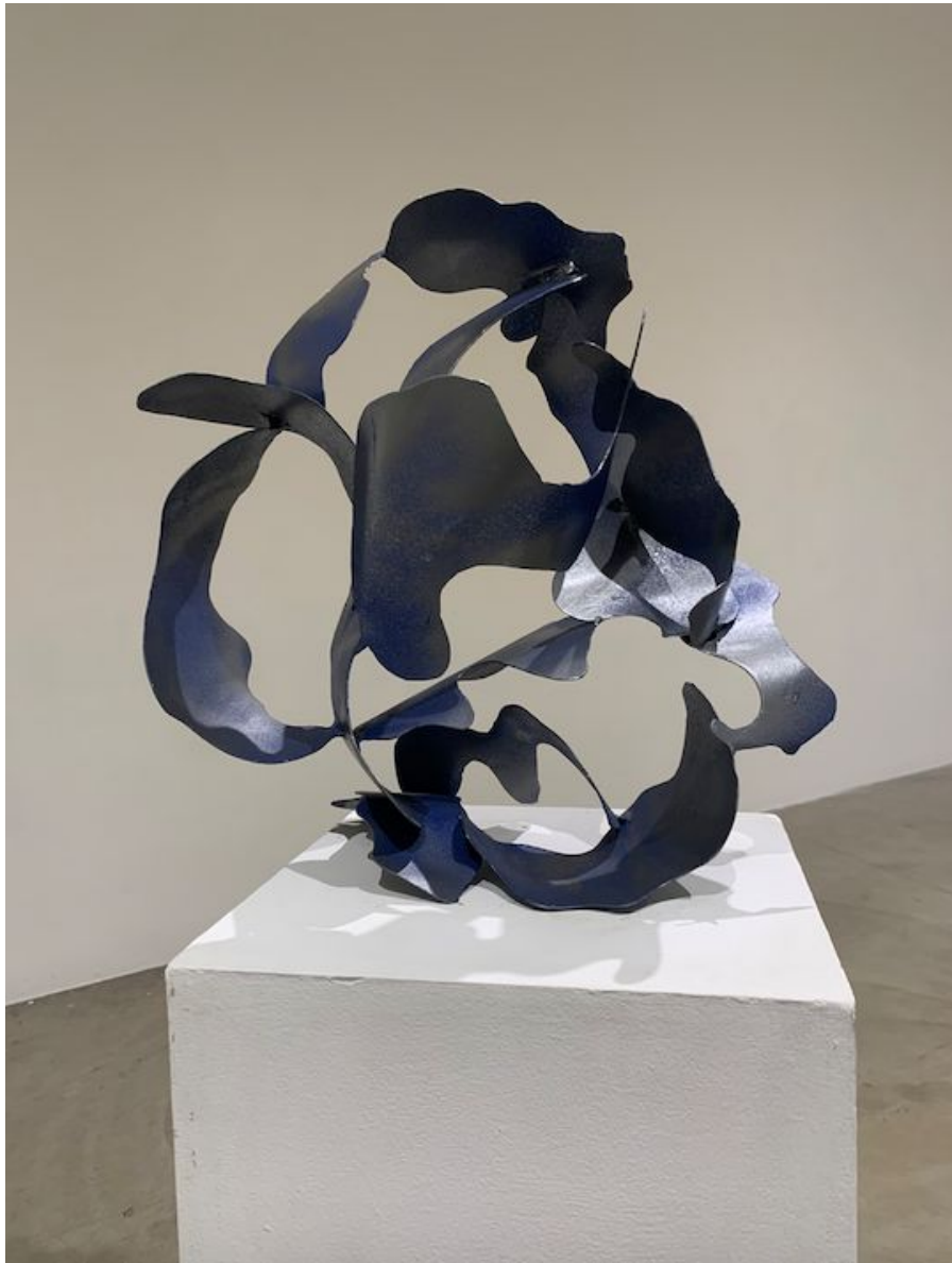
Lucy Manalo Twisted Cami 24" x 18" Plasma cut and welded steel, paint 2019