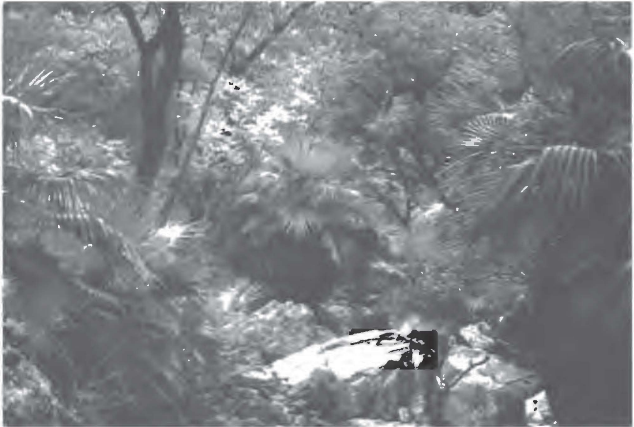
Fig. 7. Brahea nitida . Northeastern Sonora, Rancho Pinalito, Sierra Torro Muerto. Photo by E. J., August 1993.

ently also on rhyolite; growing in crevices or among rocks on steep slopes, sheer cliffs, and canyon walls, and less often along canyon bottoms. The northernmost populations are in riparian canyons in Sonoran Desert-oak woodland ecotone in northeastern and north-central Sonora (Fig. 6, 7). This palm also occurs in widely scattered mountain canyons east of the Sonoran Desert. In southeastern Sonora it is sometimes common in narrow, riparian canyons and on cliffs in tropical deciduous forest, oak woodland, and pine-oak woodland or pine forest.