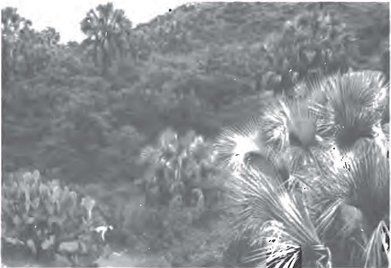
Fig. 8. Sabal uresana . Northeastern Sonora, Municipio de Nácori Chico, Rancho Napopa. Mesquite-grassland-Sonoran Desert vegetation. Note the costapalmate, curved leaf blades of the immature palm in lower right. Photo by E. J., August 1993.

blackish; seeds 10–16 mm in diameter, 4–10 mm in height, depressed-globose, dark red-brown (“chestnut”) to blackish, glossy. Flowering April to June, mostly in May; fruits ripening in August in the desert, and September and October in the mountains. 2n = 36 (Eichhorn 1957).