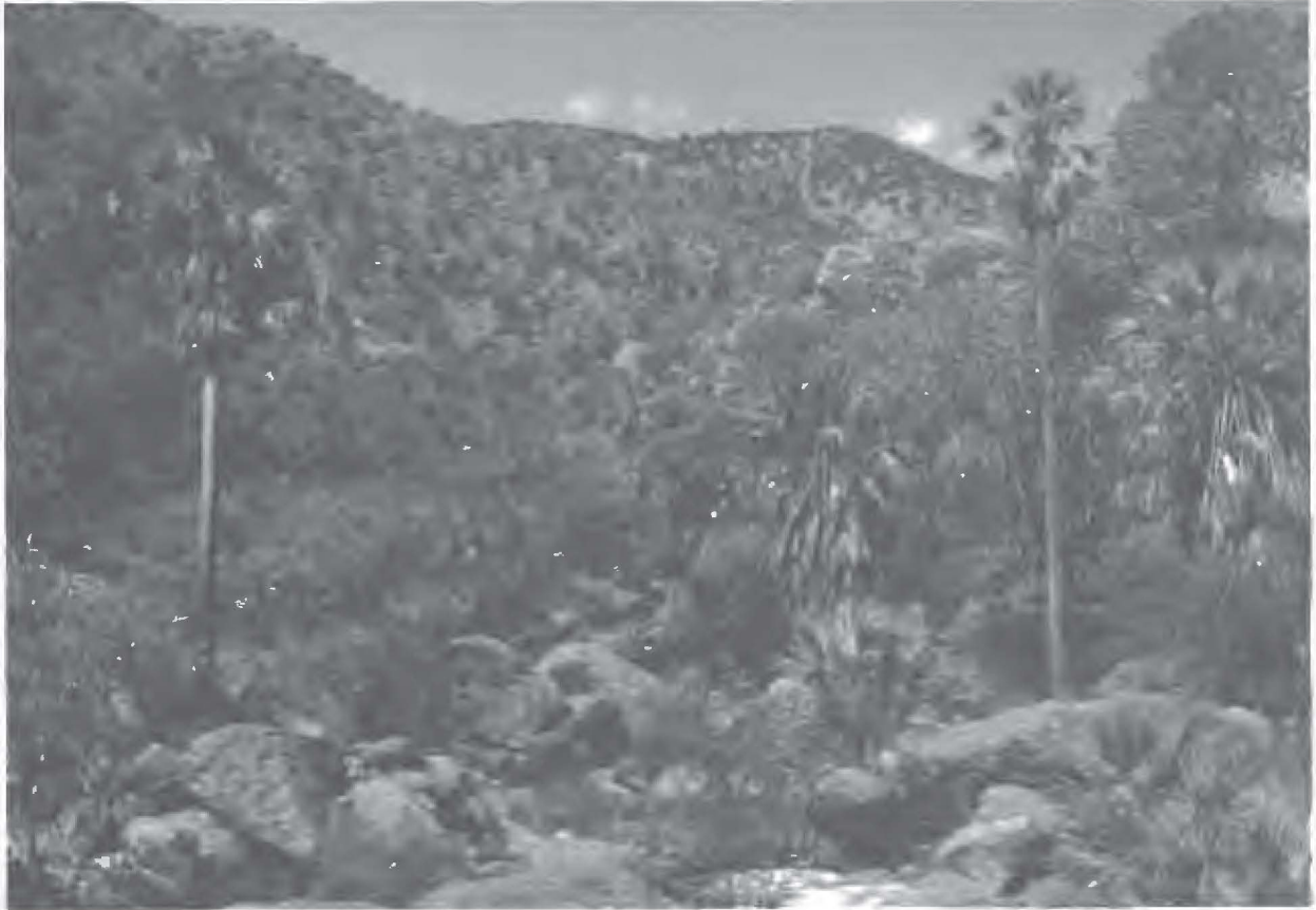
Fig. 5. Brahea elegans . North-central Sonora, Sierra de Nacozari, upper margin of Sonoran Desert and oak woodland vegetation with many riparian species; collection site for Felger et al. 3288. Photo by R. S. F., June 1960.

those in east-central Sonora but seem to be somewhat less robust than those of northeastern Sonora. The leaf blades are generally tougher and much duller ("whiter") than those of the east-central and northeastern Sonora populations.