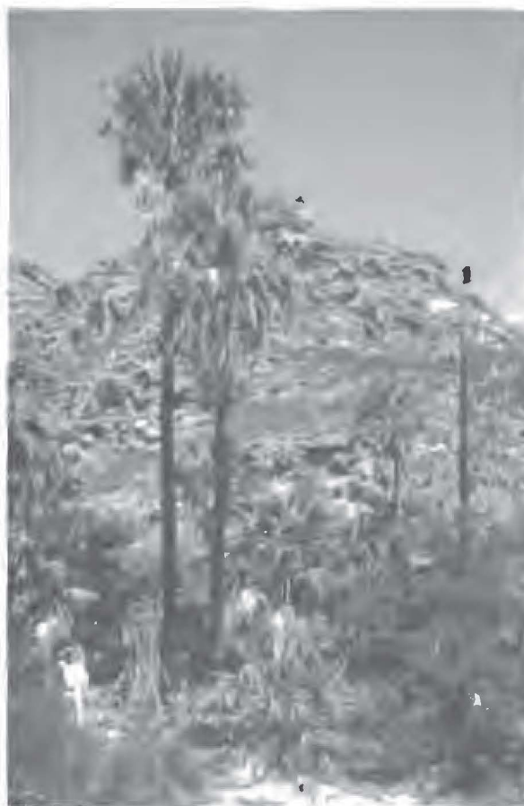
Fig. 4. Brahea elegans . West-central Sonora, Cañón Las Barajas. The tallest palm is Sabal uresana , the others are B. elegans . 1995.

Inflorescences 10–12 per tree, mostly longer than the leaves, 205–340 cm long. Bractlets 1.0–1.5 mm long. Flowers (1)2 or 3 in clusters. Sepals 1 mm long, thin, cupped, broad, and scarious. Corollas sympetalous below, the lobes 1.6 mm long, thick and broadly deltoid. Filaments short and slender. Fruits rounded, (15.8–)18.0–19.5 mm maximum diameter. Seeds 14.5–