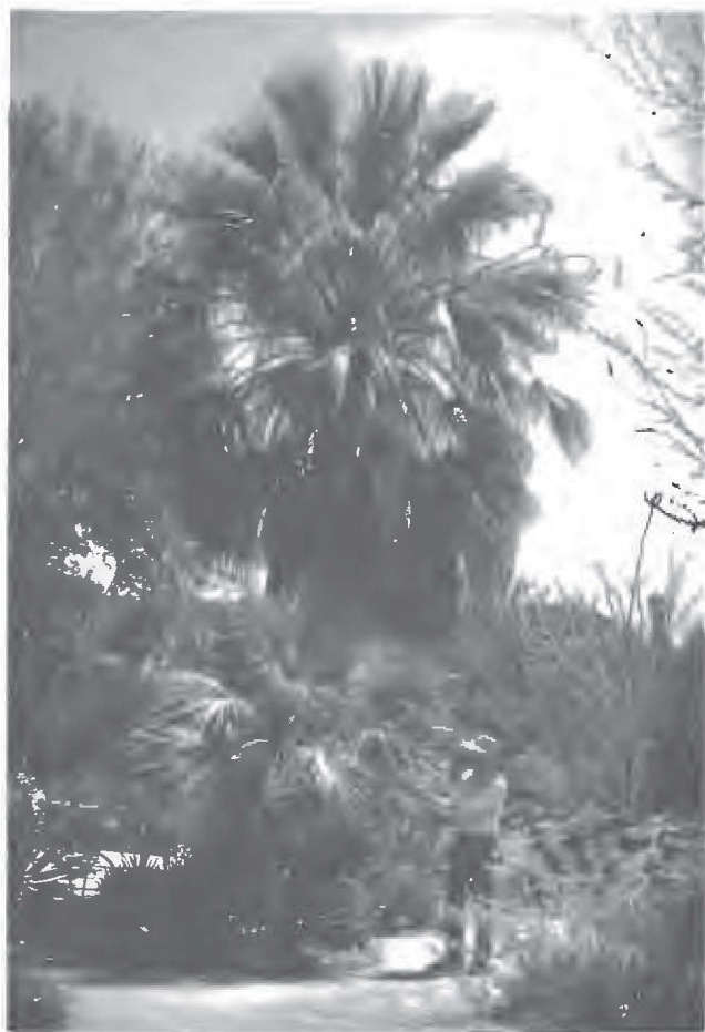
Fig. 2. Brahea aculeata and B. elegans at Arizona-Sonora Desert Museum, Tucson. Grown from seed collected in 1970, and planted simultaneously in 1972 from one-gallon containers. Brahea aculeata , smaller palms on left, from the vicinity of Sabinito Sur, east of Alamos, and B. elegans , on right, from Cañón del Nacapule. Photo by R. S. F., April 1998.