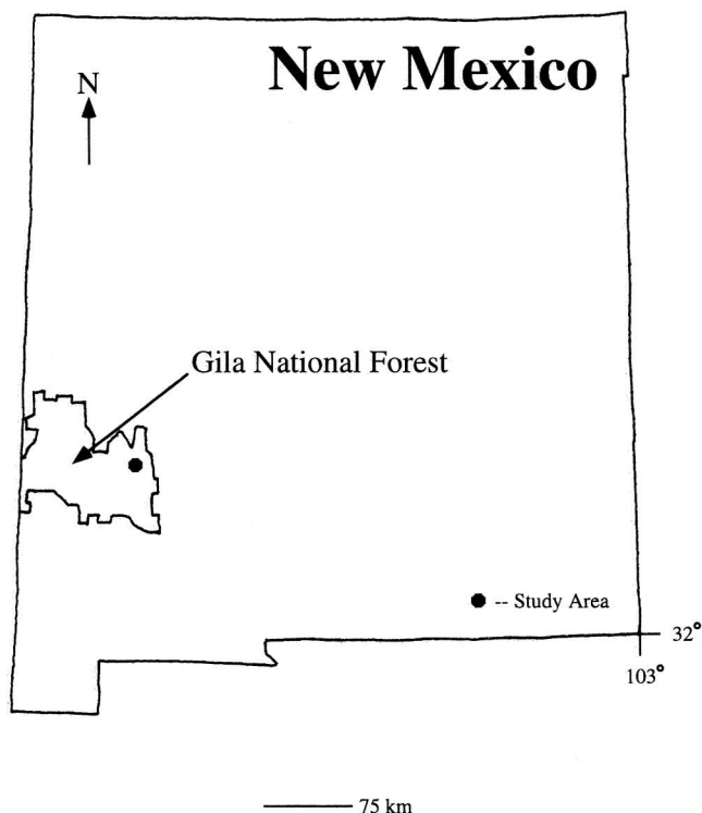
Fig. 1. Location of the Gila National Forest and the study area in New Mexico.

The Gila National Forest (originally called the Gila River Forest Reserve) was established in 1899 and is managed by the United States Forest Service. It is lo-