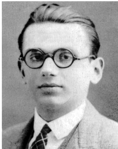
Figure 2: Kurt Gödel, as a student in Vienna.

Kurt Gödel (1906-1978) is well known for his celebrated incompleteness theorem. He first composed an ontological argument around 1941 while still in