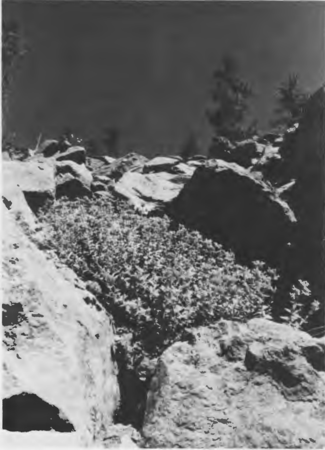
Fig. 2. Photograph of large Monardella stebbinsii from type locality showing matlike habit.

a curious ashy to lead-gray to plum color due to a combination of soft white pubescence and purplish-red pigments that masks the green. Both leaf surfaces may be reddish, especially the adaxial surface near the apex.