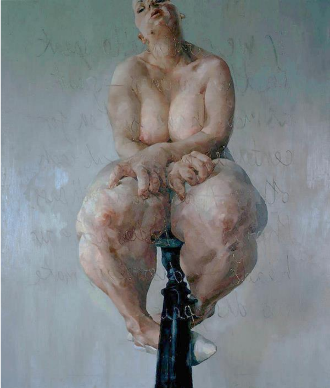
Jenny Saville Propped (2002) Oil on canvas 84 x 72 in http://www.saatchigallery.com/aip/jenny_saville.htm