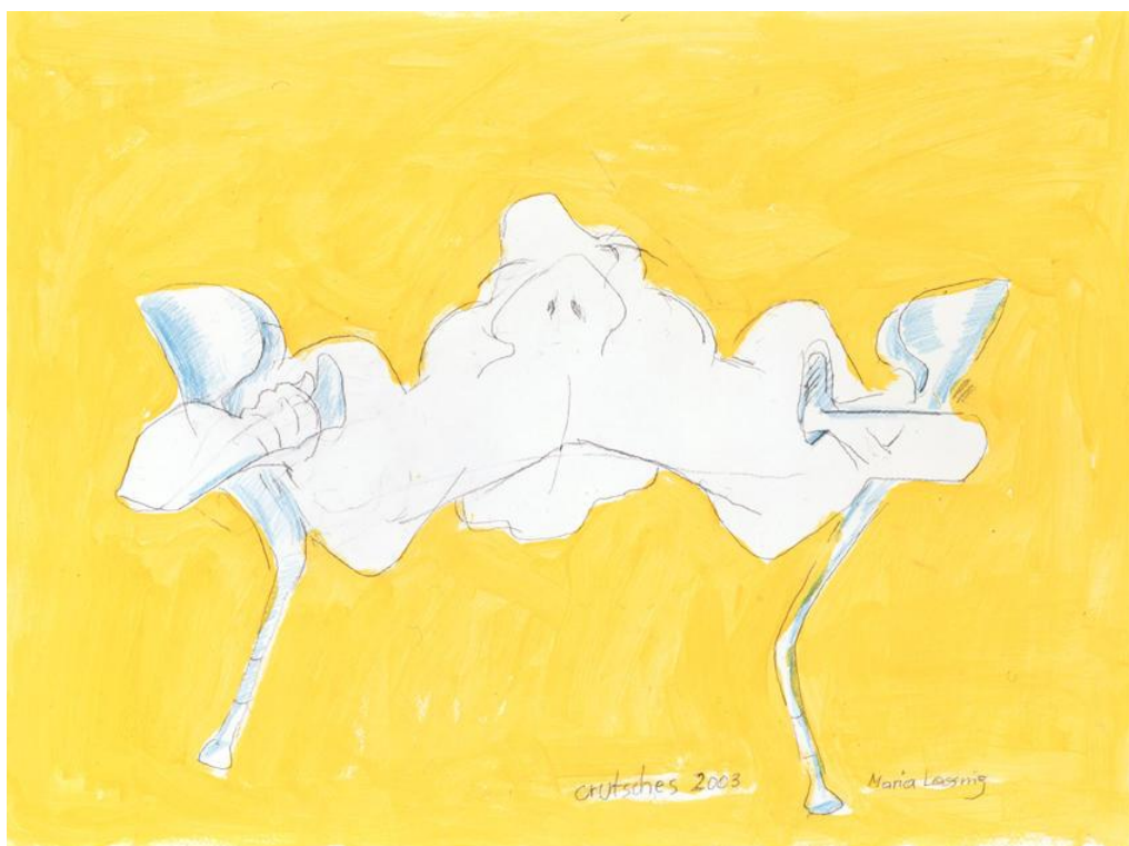
Maria Lassnig Crutches (2003) Pencil and watercolor on paper 17 ¼ x 23 ½ in http://www.petzel.com/exhibitions/2005-11-19_maria-lassnig/