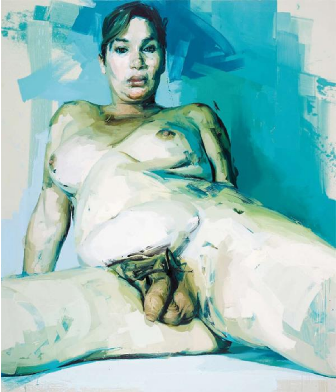
Jenny Saville Passage (2004) Oil on canvas 132¼ x 114¼ in http://www.saatchigallery.com/aip/jenny_saville.htm