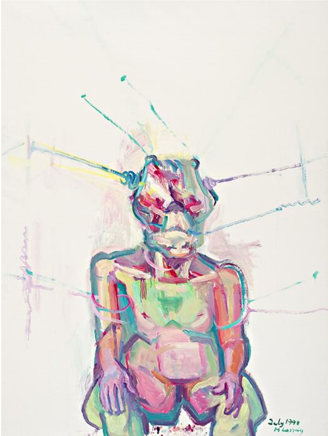
Maria Lassnig Scienza 2 (1998) Oil on canvas 59 x 78 ¾ in http://momaps1.org/exhibitions/view/376