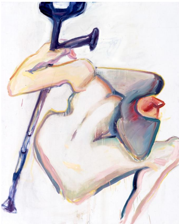
Maria Lassnig Untitled (One Crutch) (2005) Oil on canvas 49 ¼ x 39 ¼ in http://www.petzel.com/exhibitions/2005-11-19_maria-lassnig/