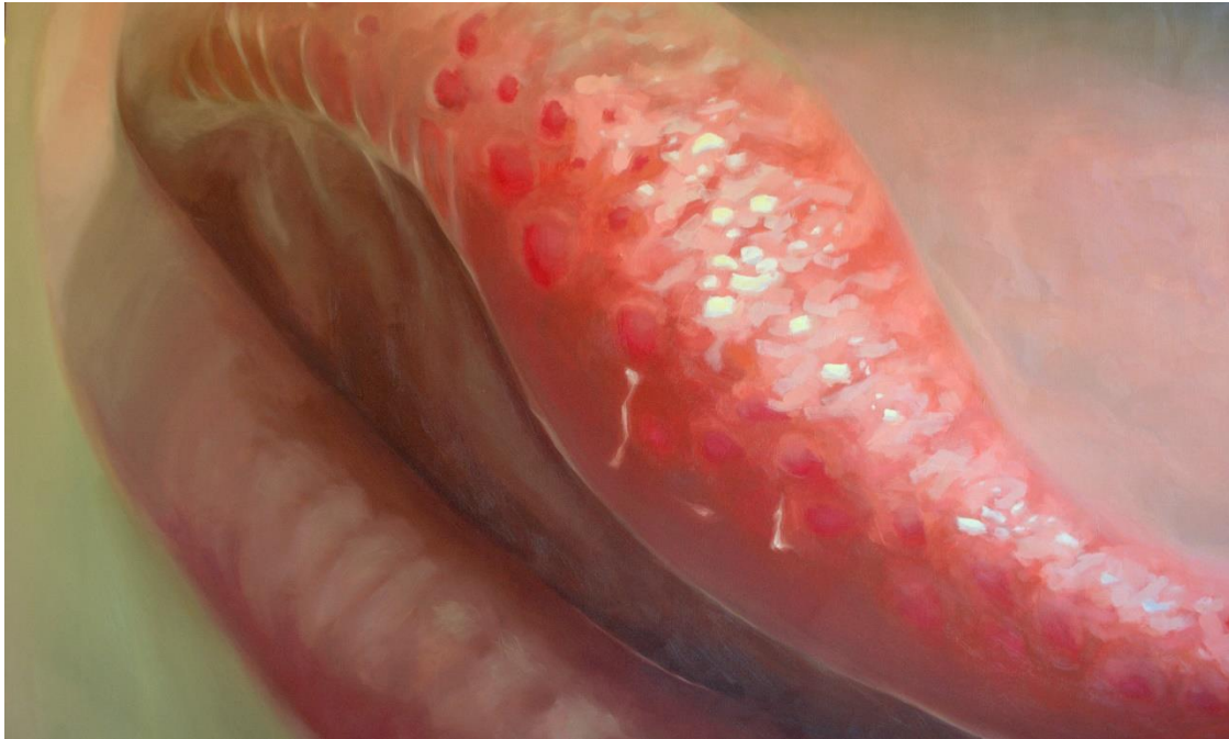
Emily Wages Tasteless (2015) Oil on canvas 36 x 60 in