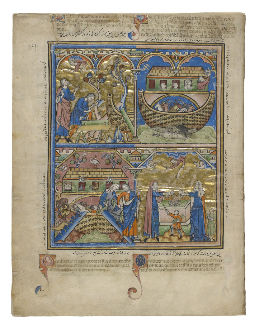
Figure 1: The Morgan Picture Bible, also known as Morgan Crusader's Bible or Maciejowski Bible (c. 1240). Morgan Library & Museum, New York: www.themorgan.org. MS M.638, folium 2v. There are Latin, Persian, and Hebrew inscriptions. In this page, following Genesis 6 to 9 and in obedience to the Lord, Noah built a huge ark, classified animals for salvation. After the storm, Noah searched for a dry land by releasing a dove and a raven. Then, on Mount Ararat, Noah, his family and all animals descend to promised land. Grateful, Noah's family offered sacrifices to the Lord, starting a new beginning.