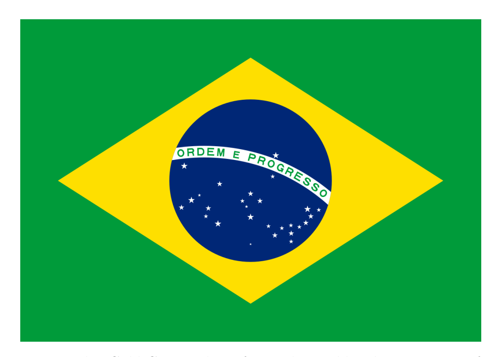
Figure 4: The Gold-Green Flag of Brazil. All stars represent the sky at Rio de Janeiro, the second Brazilian capital, at 8:30 a.m. on 15 November 1889, the Proclamation of the Republic Day. There are five-star clusters (Canis Major, Hydra, Crux, Triangulum Australe and Scorpius), where each star represents all 26 Brazilian states plus the Federal District. This is also the unique flag with an inscription, or lemma: Order and Progress.

As an interpretative tool, one would also find different clusters from the Brazilian flag using the K-means routine. This is still fine because the astronomical groups were first determined arbitrarily, including cultural, social and historical contexts. This is the power and the curse of some exploratory tools—they can sometimes give us a new answer, or at least a new way to think about the problem in an interesting way.