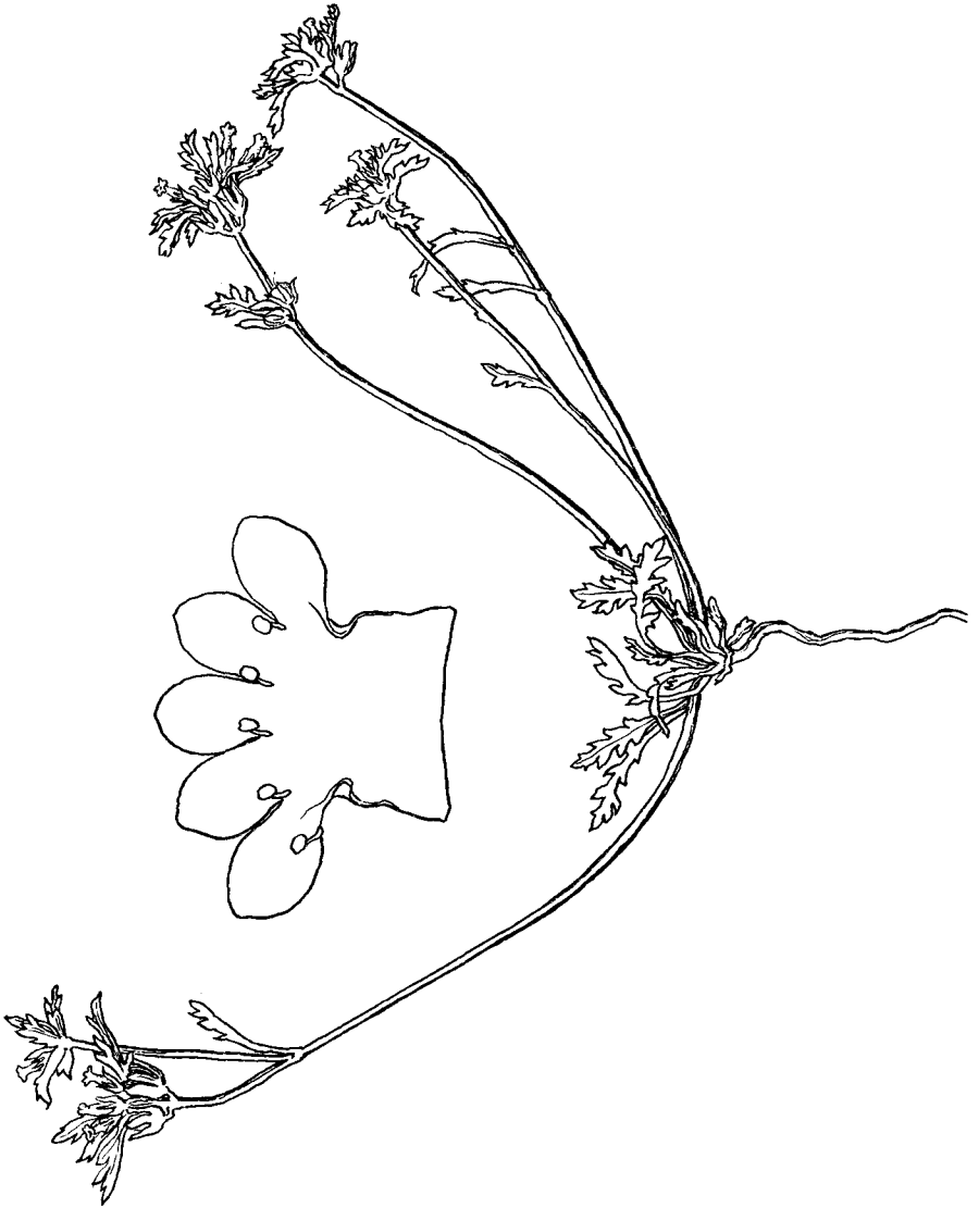
Fig. 6. Ipomopsis polycladon . (from Abrams, Illustrated Flora). (Habit x 1).