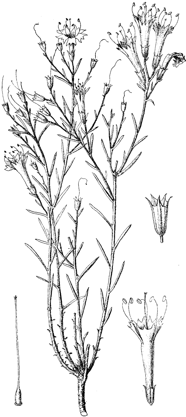
Fig. 1. Ipomopsis tenuifolia . (from Brand, Das Pflanzenreich). (Habit x 1; flower x 2).