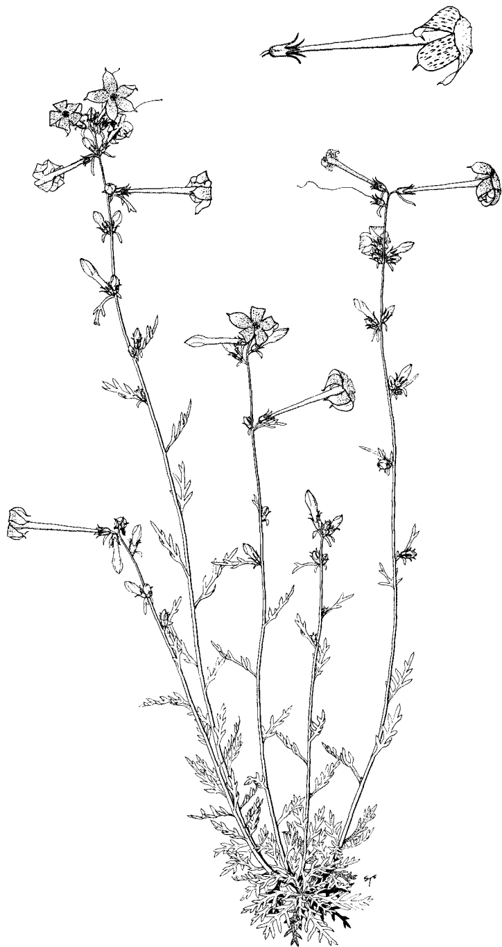
Fig. 3. Ipomopsis tenuituba , Kaibab Plateau. (Original). (Habit x 0.4; flower x 0.8).