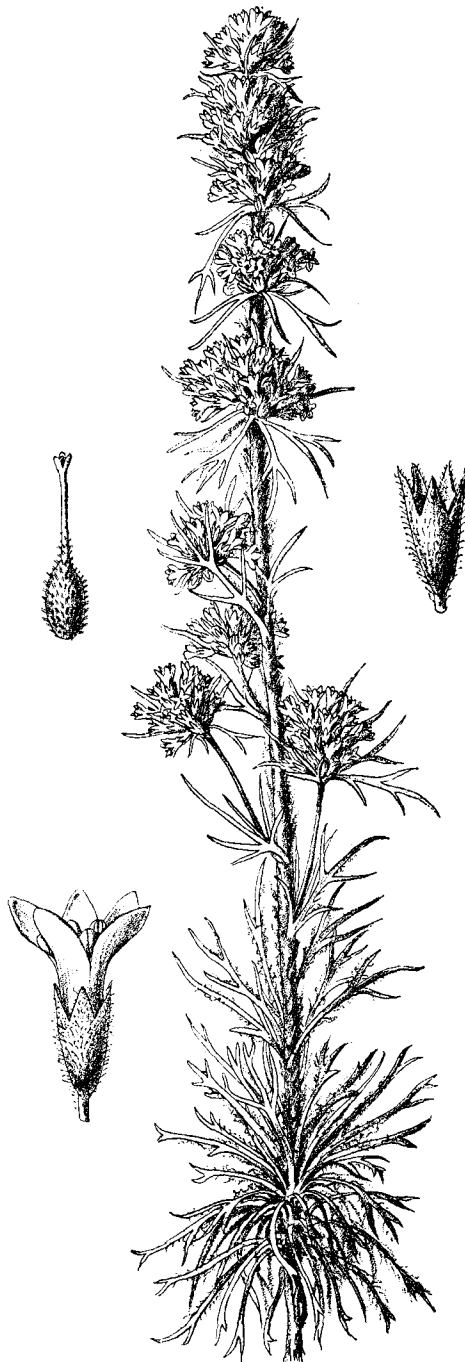
Fig. 4. Ipomopsis spicata . (from Brand, Das Pflanzenreich). (Habit x 0.5; flower x 3).