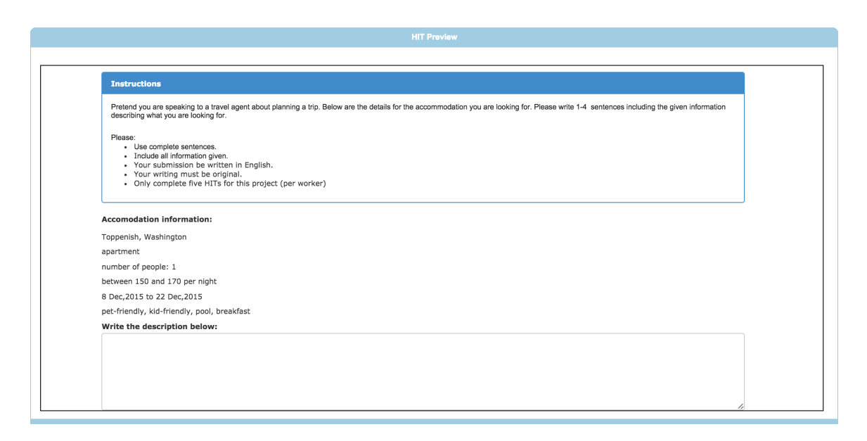
Figure 3.2: AMT Task

placed on the worker were that they had at most 1 hour to complete the task (although most workers completed it in less than a couple of minutes), that they have over a 90% approval rating for their previously completed tasks, and that they had at least 500 prior approved "HITS". These requirements were aimed to restrict the tasks to workers who had fairly high qualifications, but not so high as to severely limit the pool of workers. The structure of AMT's requests made it impossible to enforce that the workers were native English speaking and only completed 5 tasks without manually rejecting the worker's submission after it was completed. There was also a problem with workers completing more than the requested number of tasks or not following the instructions. However, since the goal of this project was to be able to handle a wide variety of natural language sentences (such as different wordings, limited information, or even recognizing off-topic searches), this resulted in acceptable data.