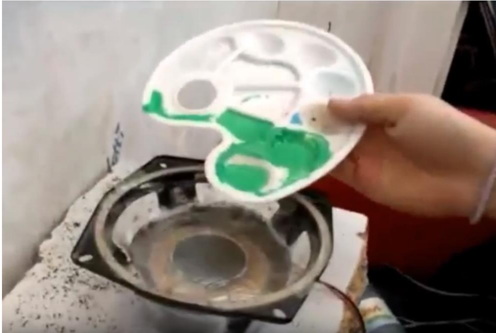
Figure 3. Soundwave Painting project by Hungarian students

In their SOUND WAVE project, the team of Szilágyi Erzsébet High School from Hungary have merged physics and art – they experimented with sound waves and how to paint with them, see Figure. 3. Similarly, this was subsequently featured in a CHAIN REACTION project, which can be seen at: https://kiks-microbit.wikispaces.com/Chain+Reaction